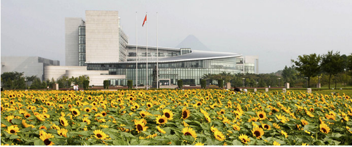
The Library of ZJNU

As for the positive effects and good results brought by these programs in strengthening economic ties and friendship between China and the recipient countries, the Ministry of Commerce of People's Republic of China will continuously intensify efforts in enlarging the enrollment scale and improving the quality of education. We believe that by going through the programs and obtaining relevant qualifications, beneficiaries are put in a better stead to embrace a successful career and brighter future.