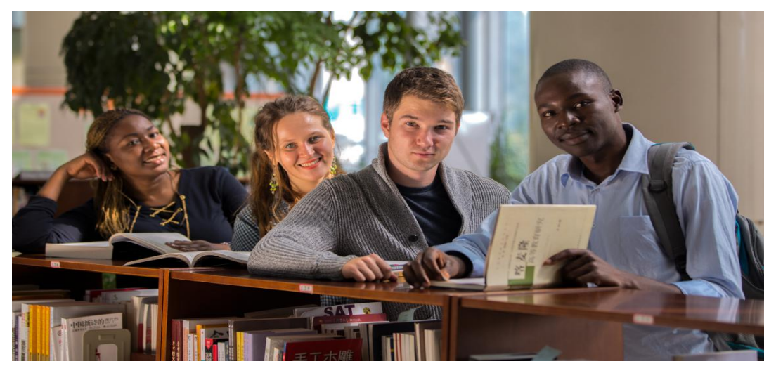
Foreign Students at ZJNU

3. Graduation Thesis: Students are required to finish a graduation thesis in English up to the master standard. Graduation thesis should be submitted and defended in the middle of the 4th semester.