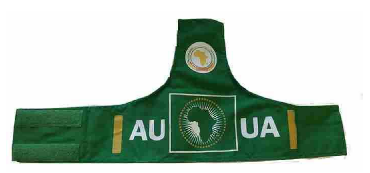
2. ARM BAND