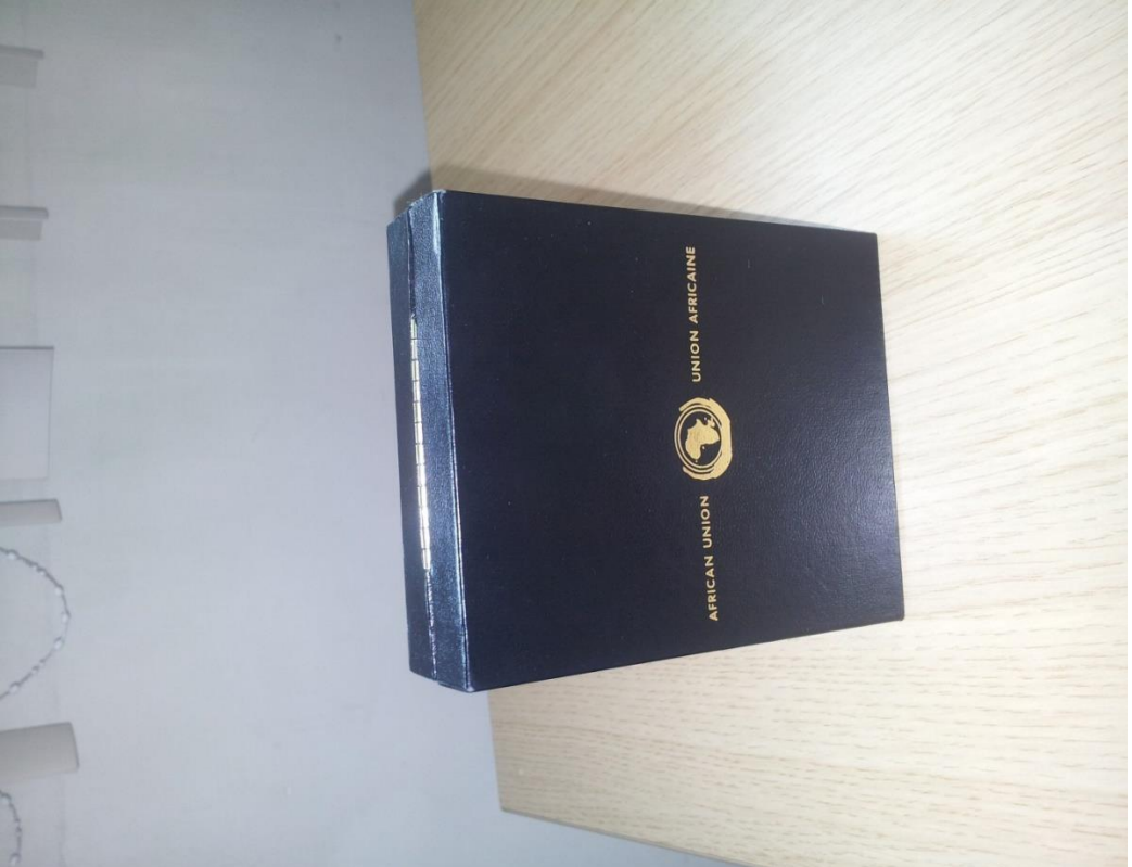
MEDAL SETS AND MEDAL CASE