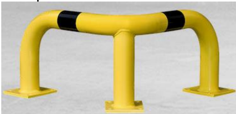
Corner protection barriers