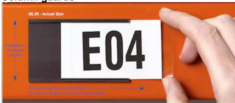
Magnetic label holding