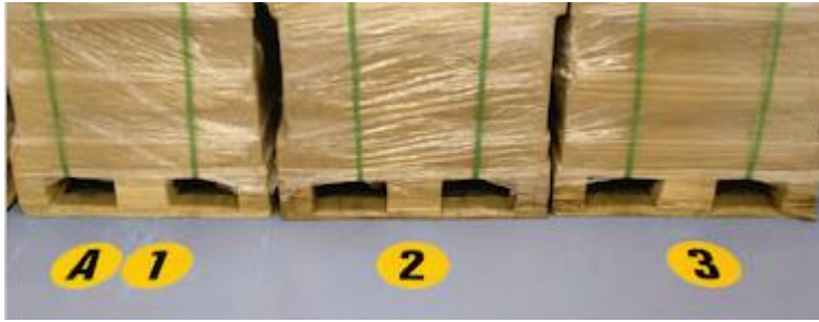
Floor markers - numbers and letter