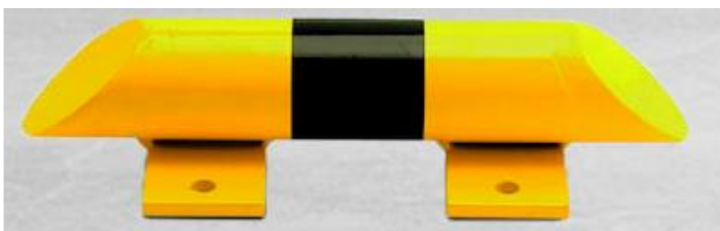
Wall stop barriers