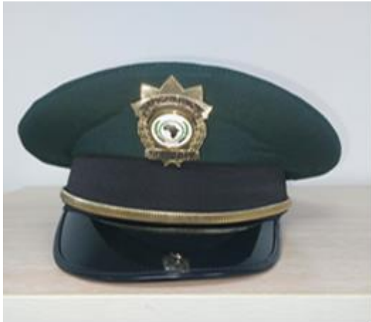
Grand Uniform Hat for Male