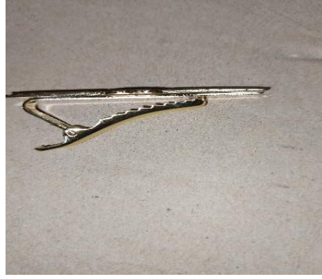
Tie clip side view