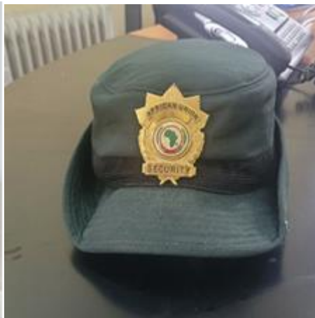
Grand Uniform Hat for Female