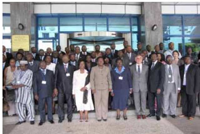
Participants at the AUC Parliamentarian Colloquium in Entebbe, 4-6 June 2012.