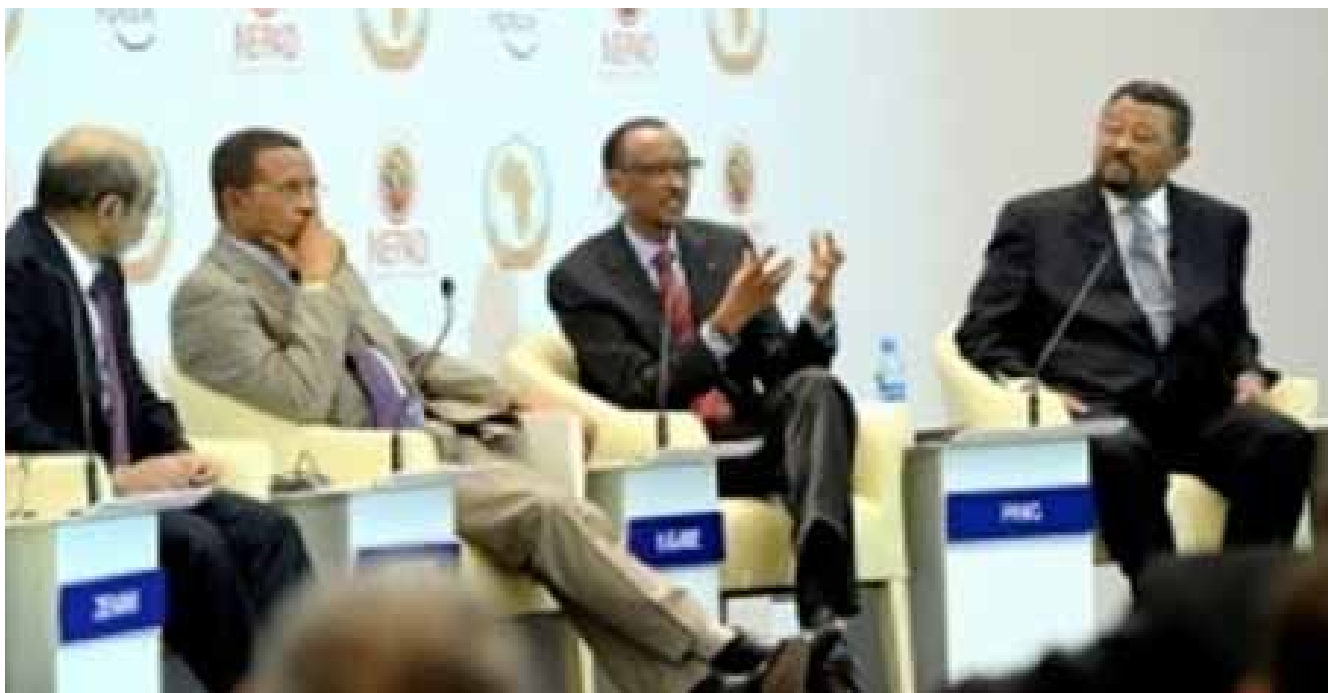
(l-r) Late Ethiopian Prime Minister, H.E Meles Zenawi, Tanzanian President, H.E Jakaya Kikwete, Rwandan President, H.E Paul Kagame and former AUC Chairperson, H.E Jean Ping on a panel discussion during the Grow Africa meeting