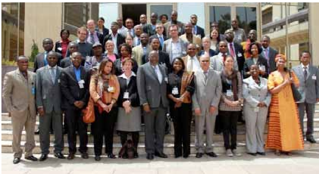
Expert group meeting on capacity development for land policy in Africa 27-28 June 2012, AUCC, Addis Ababa, Ethiopia

Studies are on-going on mainstreaming Land issues into the CAADP developed agricultural and food security investment plans of AU Member States as part of efforts in mainstreaming land in the agenda for Africa's Development.