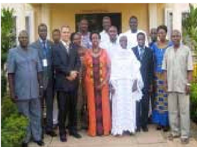
H.E. Commissioner, REA with AU-SAFGRAD staff