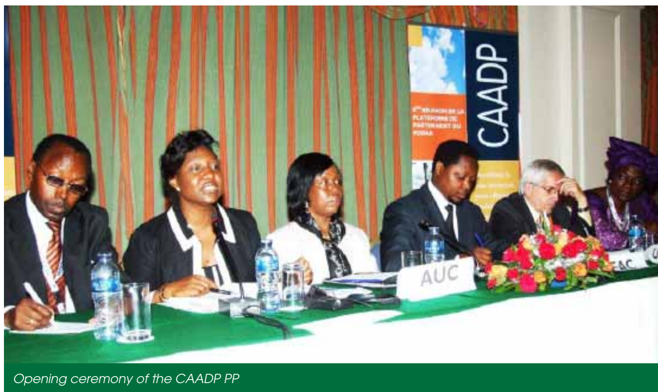
Opening ceremony of the CAADP PP

Further, AUC through DREA hosted on May 9th 2012 a Grow Africa Partnership event held in Addis Ababa in the margins of the 2012 World Economic Forum on Africa, in which seven AU Member States (Burkina Faso, Ethiopia, Kenya, Ghana, Rwanda, Mozambique and Tanzania) had presented concrete business proposals on specific and well identified and articulated value chains to national, regional and global business leaders and companies. At the same meeting, Heads of State and Government from Rwanda, Ethiopia and Tanzania had articulated, in very clear terms using illustrations and examples, that the Grow Africa initiative was only to be understood as part of Africa’s Agricultural Transformation agenda – CAADP. It was acknowledged that the Grow Africa partnership was a catalyst to the CAADP implementation through mobilization of private sector resources and actors to finance private sector priorities as articulated in country investment plans.