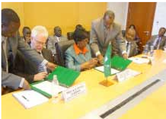
MOU Signing ceremony with GALVmed (November 2012).