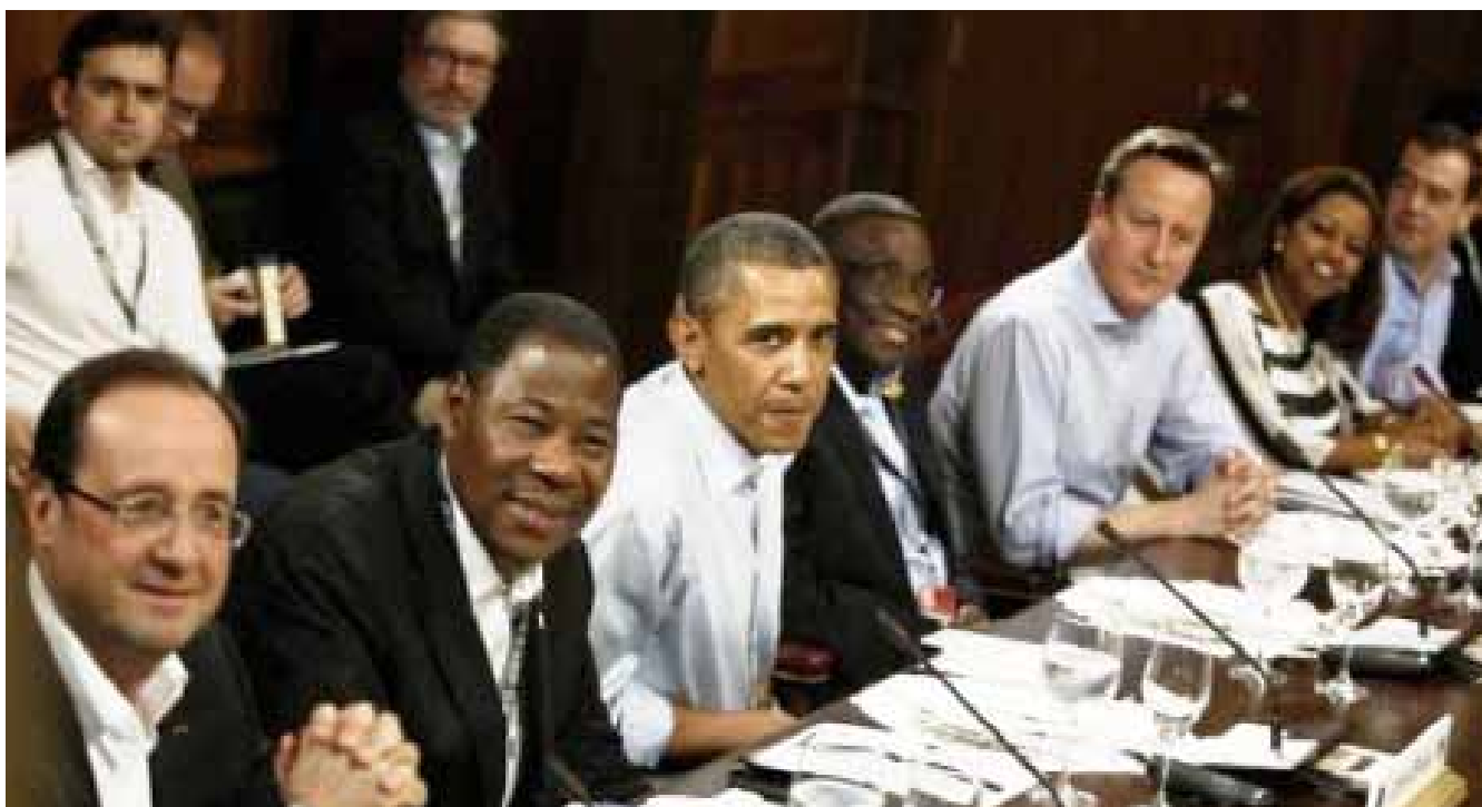
H.E Boni Yayi, President of Benin, (second from left) with G8 leaders

DREA was also involved in a key engagement on how to align CGIAR work to CAADP priorities and principles. To this effect, DREA represented by the Director of DREA and the CAADP Technical Adviser, attended a planning meeting in Dublin, Ireland between 16 and 19 September 2012 to review and provide guidance on how to shape the work of CGIAR in line with the African agriculture development process under CAADP. The key input to the meeting by DREA was to define the demand for CGIAR reforms based on a series of principles and priorities as enshrined in the CAADP Process.