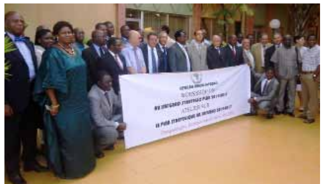
Group Photo of the validation workshop of AU-SAFGRAD's Strategic Plan