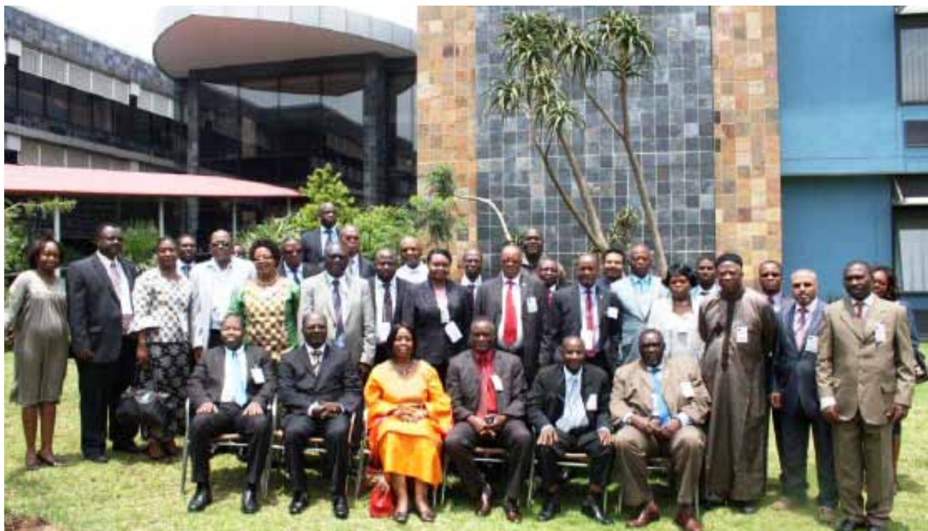
DREA staff with parliamentarians

The Agriculture and Food Security Division in collaboration with partners organized the 2nd African Conference on Organic Agriculture in Lusaka, Zambia in May, 2012.