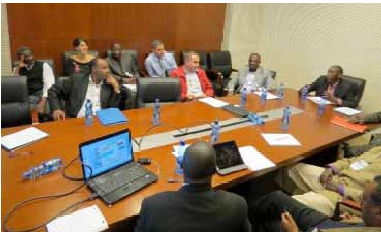
Working Group sessions during the validation workshop for the Institutional arrangements, resource mobilization and action plan for the AU Policy Framework for Pastoralism.

The Department is presently in the process of developing a monitoring and evaluation tool for effectively tracking the progress of implementation of the framework at national and regional levels and also building the capacity of pastoral networks in order for them to effectively engage in national dialogue processes impacting on their livelihood. Policy Dialogue sessions on emerging issues impacting on Pastoralists are also being organized to sustain awareness