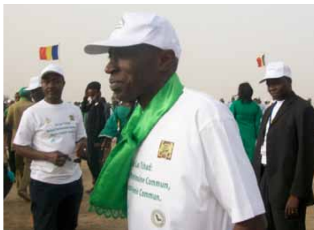
DREA staff during the commemoration of the Africa Env't day and Wangari Maathai Day

The Africa Environment Day emanated from the decision of the OAU Council of Ministers at their Seventy-Sixth Ordinary Session, which took place in Durban, South Africa in July