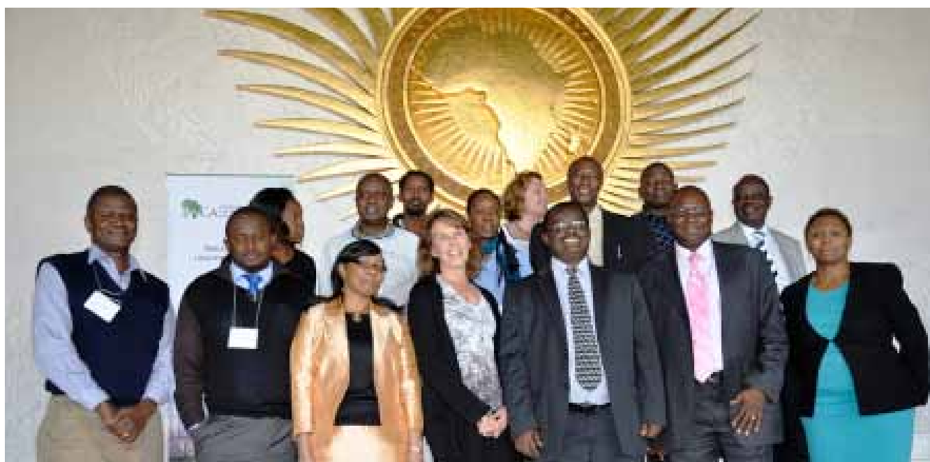
PACA steering committee members

The first ever Joint AU Conference of Ministers of Agriculture and Ministers of Trade was convened from 29 to 30 November, 2012 at the AU Conference Centre (AUCC) under the theme "Boosting Intra-African Trade: A key to agricultural transformation and ensuring food and nutrition security". The Conference deliberated on crucial issues of