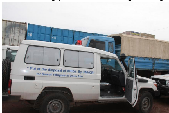
One of the 3 ambulances UNHCR handed over to ARRA.

Concerned that Somali refugees are still arriving in Ethiopia in a critically poor state of health, UNHCR convened an inter-agency taskforce in Dollo Ado on Thursday 01 September to address the continuing problem. Screening of refugees in all of Dollo Ado's camps have found in the newest