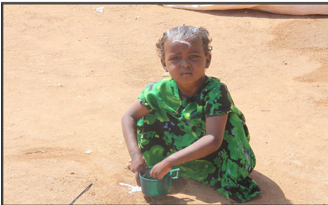
Hand-washing is one of the three key messages being promoted in Dollo Ado to mitigate possible cholera outbreak.