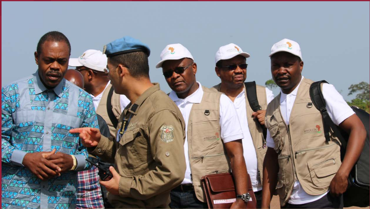
Figure 2: High level visit to the Ebola virus disease outbreak epicenter in Mbandaka and Bikoro by the Hon. Minister of Health of the Democratic Republic of Congo, Dr. Oly Ilunga; the Director of Africa CDC, Dr. John Nkengasong; and colleagues. Expeditious assessment of the gaps needed for an effective response to control the outbreak was critical.