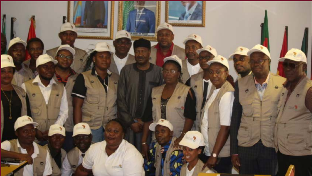
Figure 3: Deployment of Africa CDC Ebola Contingent by the great leadership of His Excellency Abdou Abbary, the African Union Ambassador to the Democratic Republic of Congo.