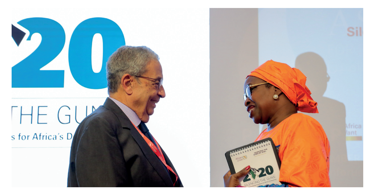
Amr Moussa, Panel of the Wise and Bineta Diop, AU Special Envoy on Women, Peace and Security at the High-Level Worskhop on Silencing the Guns in Aswan Egypt, 2019

While the continent's total population is expected to increase to 1.6 billion in 2030, and three billion in 2065, young people in Africa will total 531 million by 2065 – which will be approximately 30.2% of Africa's total population, according to UN estimates. The African Union is looking up to this demographic dividend to change the course of the continent's future.