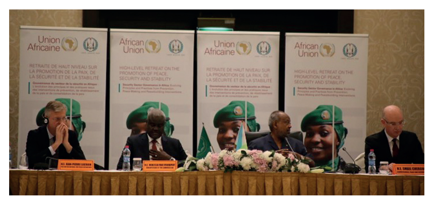
Panelists at the Security Sector Reform and Governance Forum, Djibouti City, Djibouti, 2019, Photo@STG/PSD/AUC

The 10th African Union (AU) High-Level Retreat on the Promotion of Peace, Security and Stability in Africa was held in Djibouti City, Djibouti at the end of October 2019.