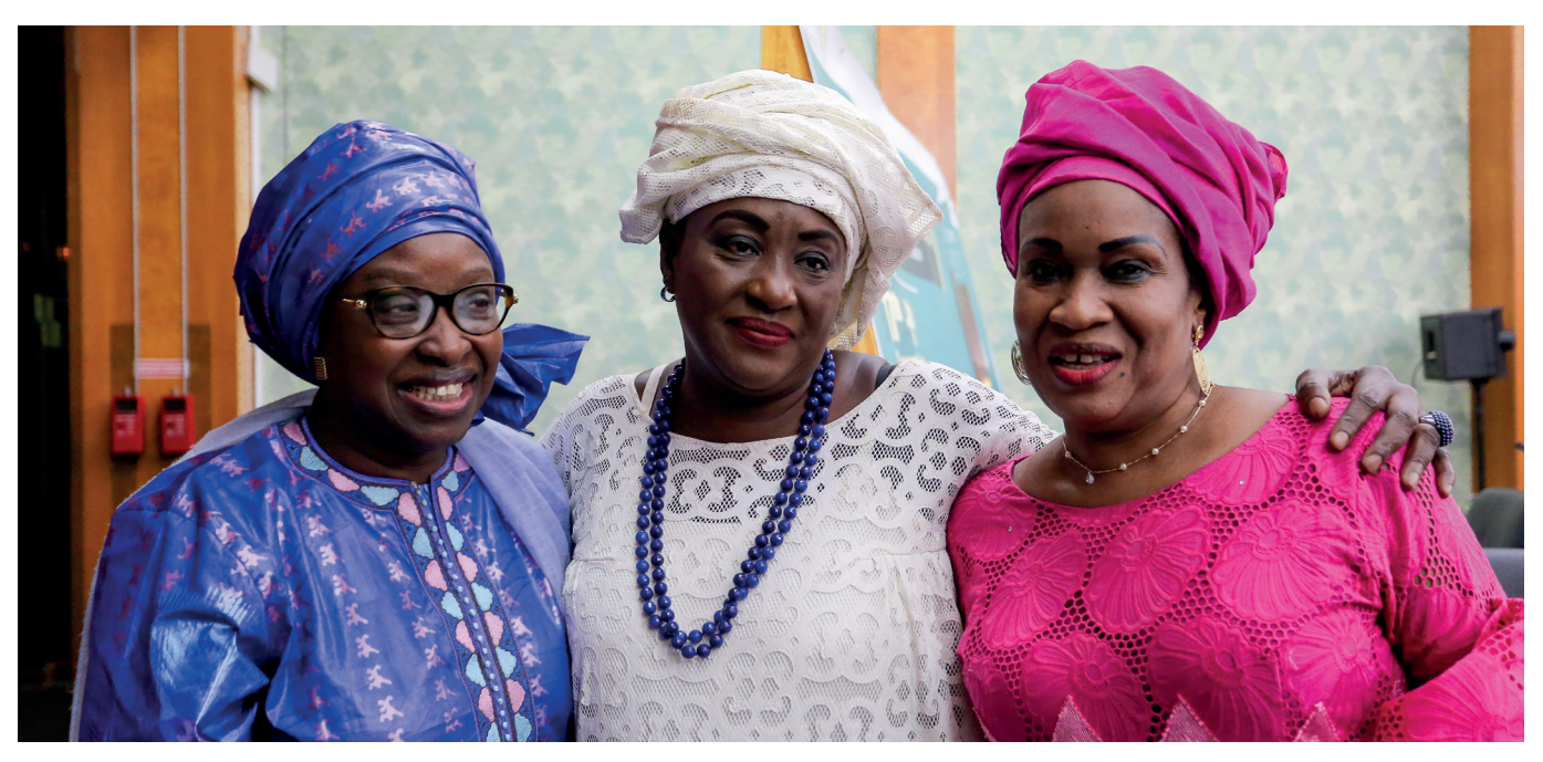
Participants at the Women, Peace and Security in Africa Event, Dakar, Senegal, 2019

In its policies and allocation of resources, the AU shows commitment to promote gender equality and women's empowerment. In fact, it is a crucial goal and part of the strategy to realise the Agenda 2063 and Aspiration 6, which puts women's participation in the center of Africa's development.