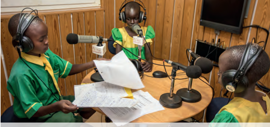
UNMISS marks day of the African child.

Africa Integration Day is for all Africans, including those in the Diaspora, and especially the African youth, who represent 65 per cent of its population and whose number is forecast to increase by 42 per cent by 2030 and double from current levels by 2055 according to the United Nations Fund for Population Activities. The African private sector, academic institutions and civil society organisations as key stakeholders are also expected to play key roles in the commemoration of Africa Integration Day. Institutions of learning, particularly at primary and secondary schools are also encouraged to form African Union Clubs where they do not yet exist and use Africa Integration Day to mount debates among students and youth on pan-Africanism, regional and continental integration. The Pan-African Parliament can also use the day to organise workshops or seminars aimed at building momentum towards its transformation into a legislative assembly once the African Common Market and deeper levels of integration are attained.