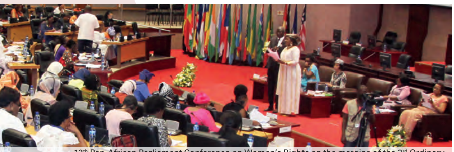
12<sup>th</sup> Pan-African Parliament Conference on Women's Rights on the margins of the 3<sup>rd</sup> Ordinary Session of the fifth Parliament of the PAP (October 2019).