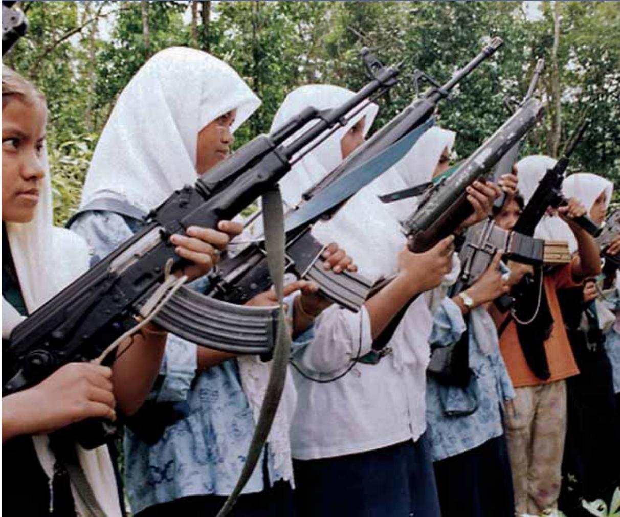
Acehnese girls in traditional Muslim dress pose with assault rifles at the camp of the Free Aceh Movement (GAM) in Pidie, Aceh province, Indonesia

Multiple grievances motivated the actions of the Free Aceh Movement (GAM) during the 30 years of civil conflict in the Province of Aceh, Indonesia, but the roots of these problems were connected to the operations and distribution of benefits from the local liquid natural gas (LNG) facility. There was a sense of injustice among the local populations stemming from the allocation of higher-paying jobs to workers from outside the province, combined with corruption and declining quality of life in the areas surrounding the operations, due to high levels of contamination and pollution. While LNG exports accounted for around 69 per cent of the Province of Aceh's GDP, most of these resources went directly to the central government in Jakarta and few development benefits were perceived in the province. In addition, there were other industrial developments in the area at the time, such as cement and chemical factories, that also gave cause for grievances, since few Acehnese were employed in these sectors. Local people complained of environmental degradation and the appropriation of traditional and culturally significant lands without compensation. They also resented the influx of foreign workers whose cultures were construed as offensive to the traditional Muslim communities in Aceh.