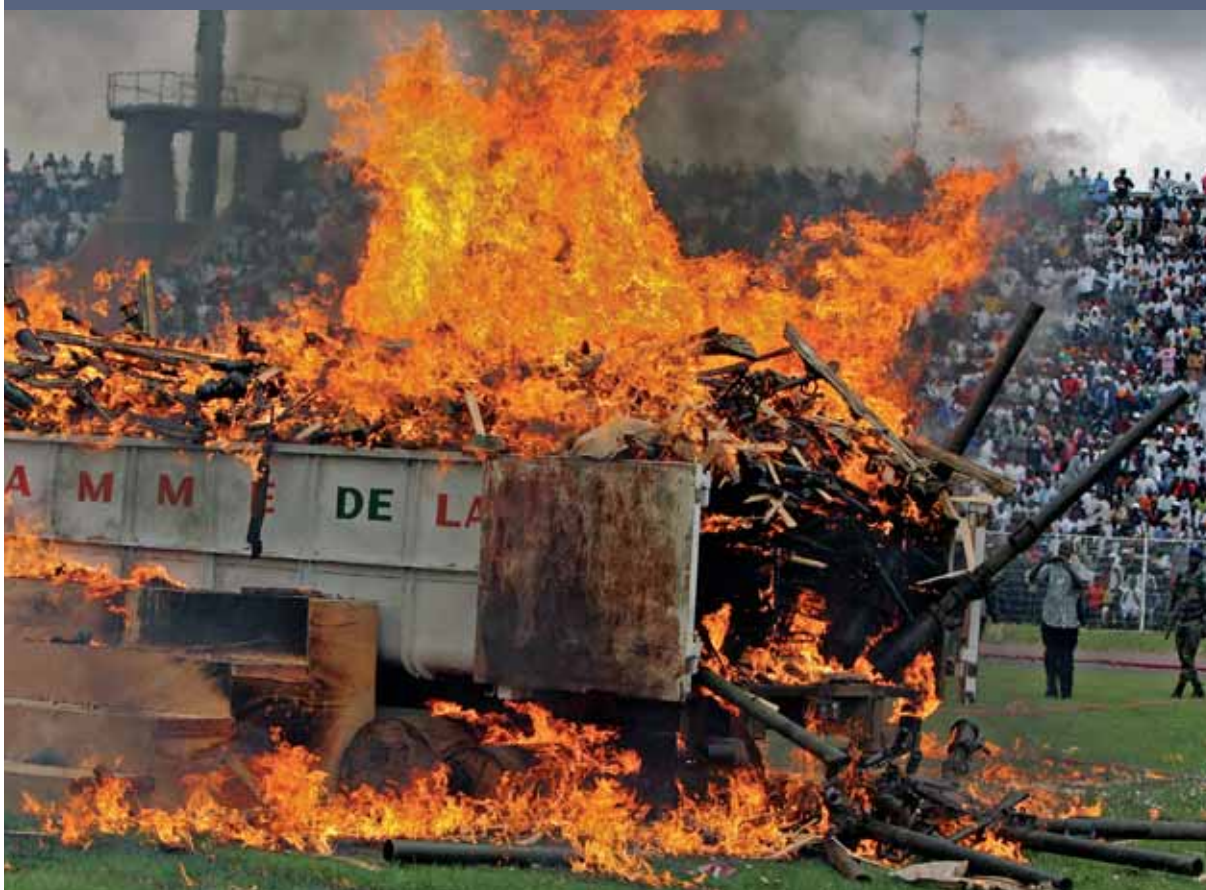
A Flame of Peace ceremony marks the start of DDR in Cote d'Ivoire in 2004

When the new government of Alassane Ouattara took office in May 2011, a new DDR programme was deemed necessary within the framework of a larger security sector reform. This programme is currently being planned and natural resources are likely to play an important role in reintegration. In 2013, UNEP began supporting the government's efforts to undertake a post-conflict environmental assessment, which will provide information on the linkages between the conflict and the governance of natural resources, and highlight potential natural resource-based peacebuilding opportunities within the context of ongoing community recovery and development.