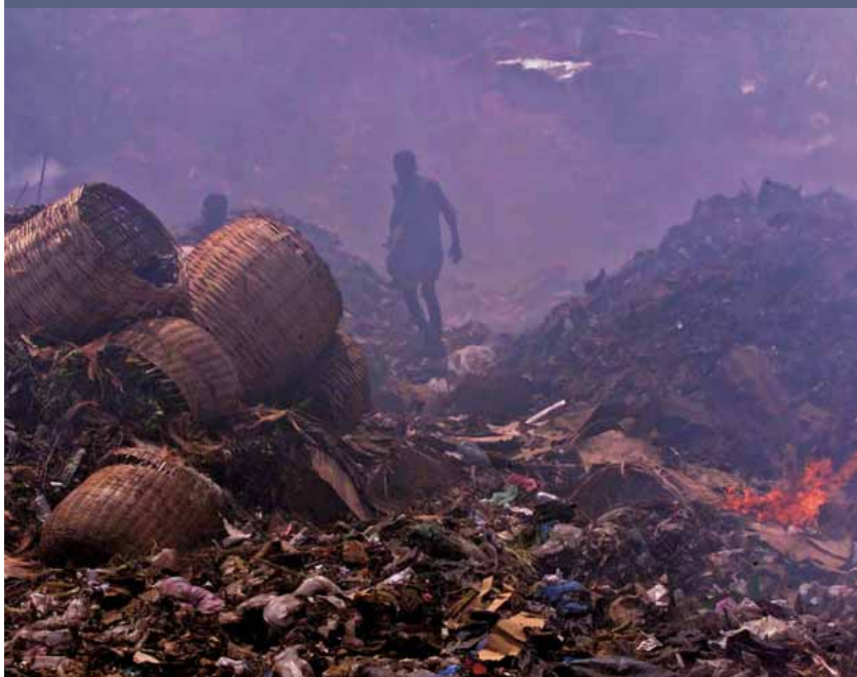
In Sierra Leone an attempt was made to employ ex-combatants in waste collection and management

Employment in the sanitation sector should be approached both with caution and with a clear understanding of responsibilities of the government and the recovery partners.