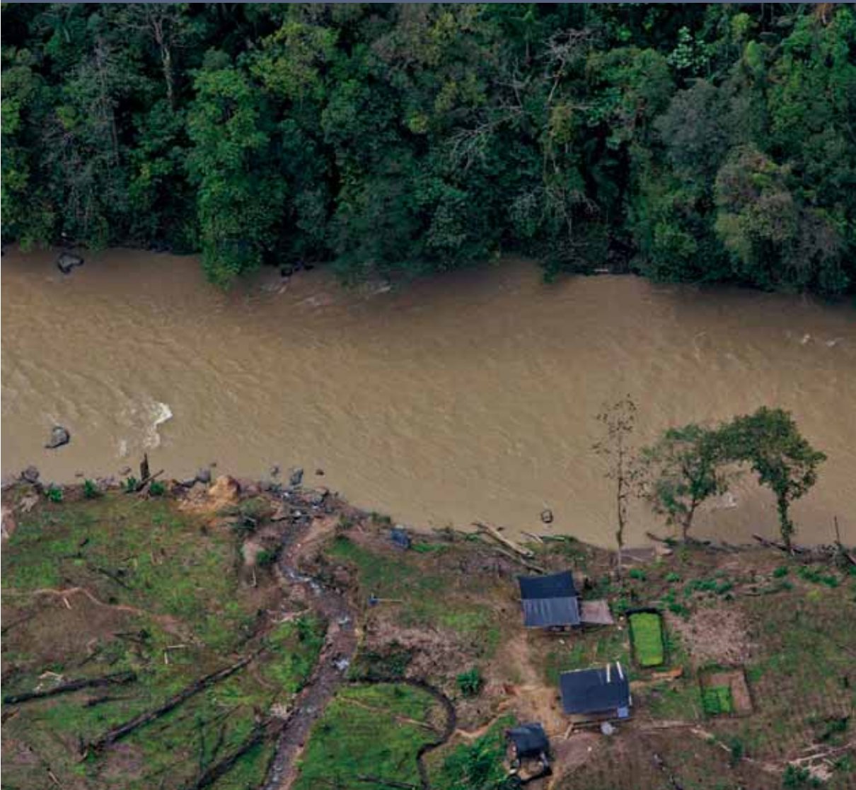
Coca seed beds, light green rectangles, are seen on the bank of a river in the Garrapatas Canyon, in Colombia's western Choco state. Natural resource-related issues in the Colombian conflict include land seizures by armed groups for illicit narcotics cultivation and deforestation

Major natural resource-related issues in the Colombian conflict include land seizures by armed groups for illicit narcotics cultivation and deforestation. More recently, militia groups composed of ex-demobilized fighters and FARC have targeted gold mines in the Córdoba region in north-east Colombia. 63 More recently, the government of Colombia and the leadership of the FARC have initiated peace talks and a first agreement was reached in May 2013 on rural land reform in the country. This agreement tackles one of the primary grievances and motivating factors for the decades-old insurgency. 64 Ensuing discussions on this throughout 2013 will determine if land reform will become a driver for peace or if it will continue to be factor in conflict.