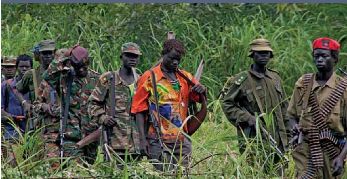
Members of Uganda's Lord's Resistance Army (LRA), 2006