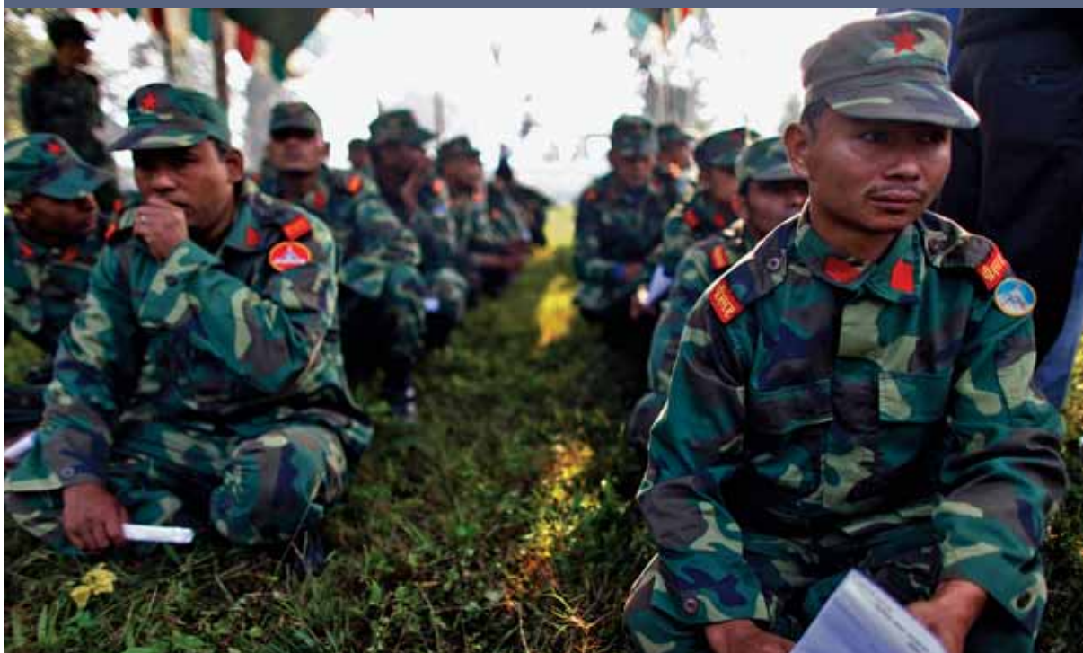
Former Maoist rebels attend an integration program at Shaktikhor Cantonment in Chitwan, Nepal in 2011. The interviews determined who will join the national army; the process continued for six years

After the signing of the peace agreement in Nepal in 2006, approximately 19,600 members of the Maoist fighters were registered and directed to one of 28 cantonment sites where they awaited news of their integration into the Nepalese National Army. Although the cantonments were originally intended to be in place for six months to one year, the process continued for six years.