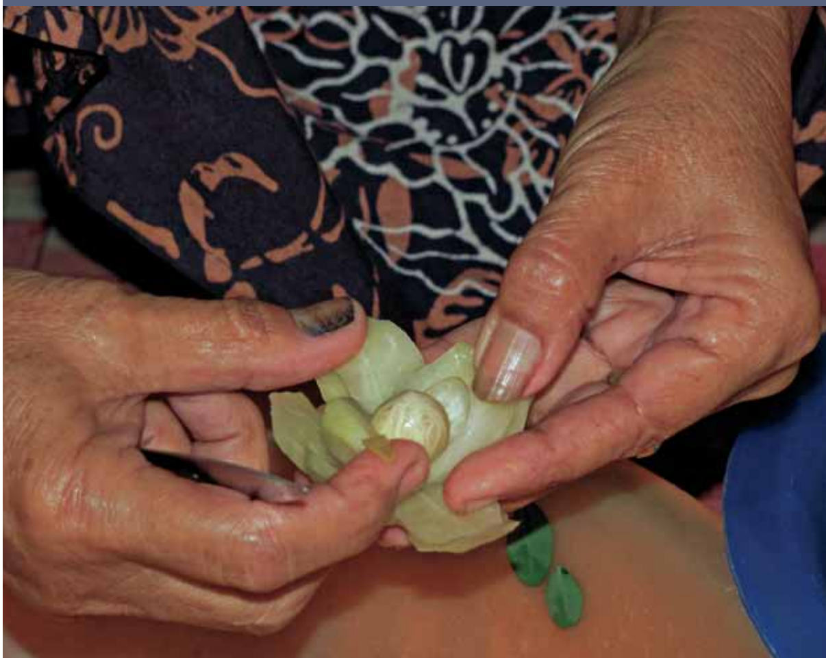
Women in Aceh Selatan supplement their income by making nutmeg fruit candies for local markets, whereas the seed and mace of the nutmeg is used to produce essential oil

Enhancing livelihoods and economic opportunities for intended beneficiaries requires the active collaboration of many actors and institutions. Forum Pala Aceh (Aceh Nutmeg Forum), established through this programme, and related government institutions, have all collectively participated in the implementation of the value chain strategy, covering cultivation, processing and marketing. 131 Particular efforts were made to engage business enterprises in strengthening supply chains and linking local producers and farmers. The product diversification trainings have not only improved their technical skills and knowledge of nutmeg farmers, but have also enabled them to expand their markets to other districts.