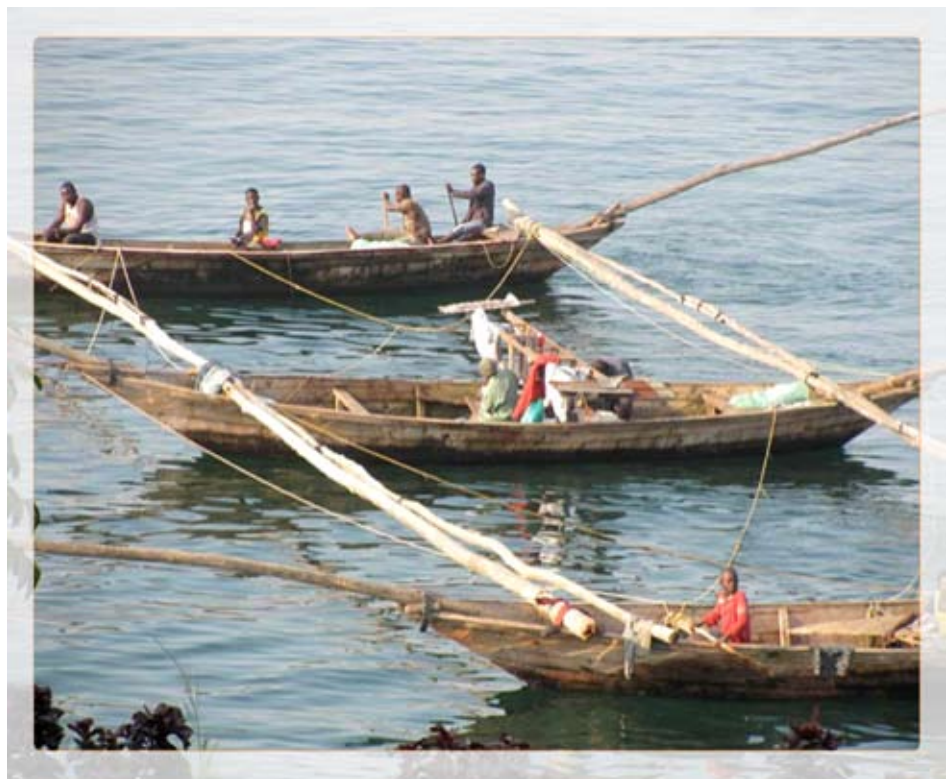
Kawaida Fishing Group on Lake Kivu, North Kivu

“This is a skill that we acquired during the