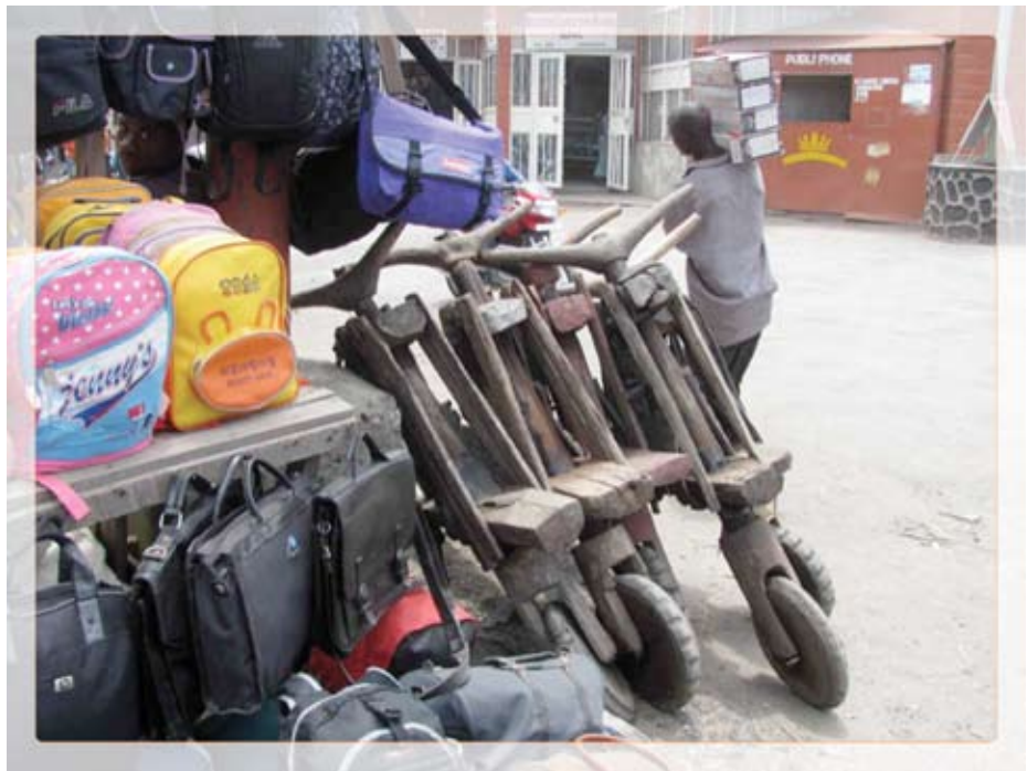
Makenga's small business and chukudus

The village of Kibumba in North Kivu is close to the border with Rwanda and is located on the slopes of the volcanic Mt Nyiragongo. However, Kibumba has perennial water scarcity due to the difficulty in drilling boreholes through the multiple layers of lava that have formed as a result of frequent eruptions. Some