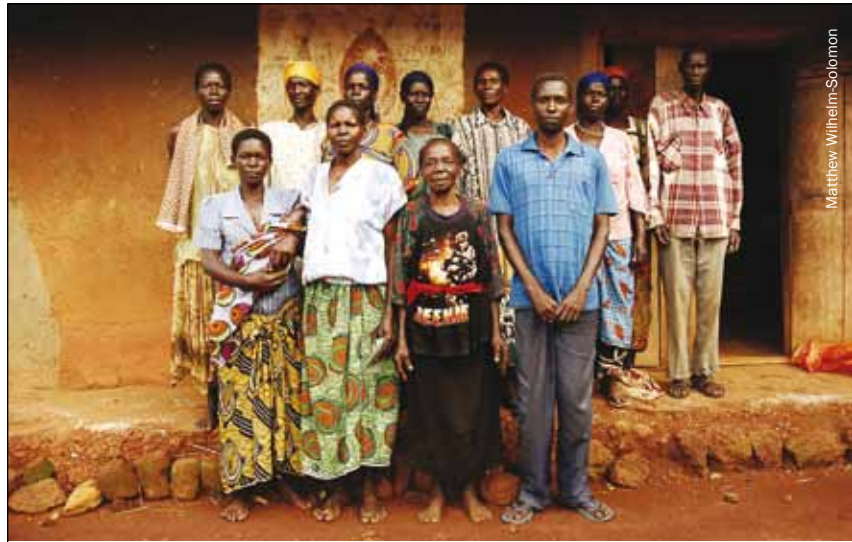
A newly formed HIV support group in a return area of Oyam district, Uganda.