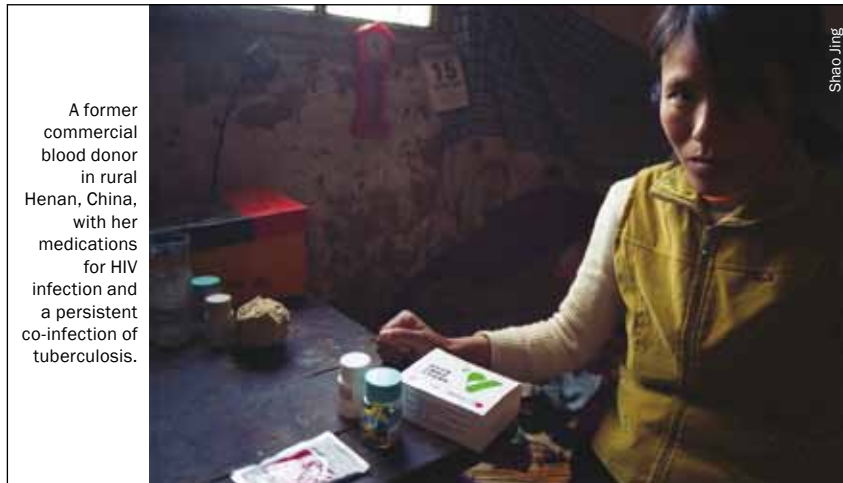
A former commercial blood donor in rural Henan, China, with her medications for HIV infection and a persistent co-infection of tuberculosis.