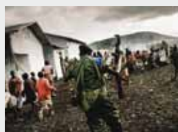
Kibati camp for displaced people, DRC.

People displaced in conflict (and on return home) often find themselves in contact with people carrying weapons in various guises. Equally, people carrying weapons are themselves generally mobile, whatever their relation to a conflict or its aftermath. In particular, members of security forces in situations of forced displacement can be agents of positive change in relation to HIV and AIDS – or part of the problem.