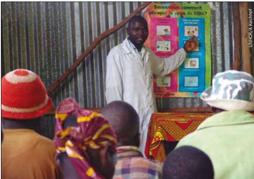
Information session on HIV/AIDS for returnees from Tanzania, Mugano transit centre, Burundi.

transmission. It is often assumed that one-off, opportunistic rape is the only form of sexual violence in conflict contexts. However, it also includes other forms such as sexual slavery and other strategic and deliberate attacks over time. There is evidence that both long-term exposure to the virus and violent sexual activity are associated with increased risk of transmission.