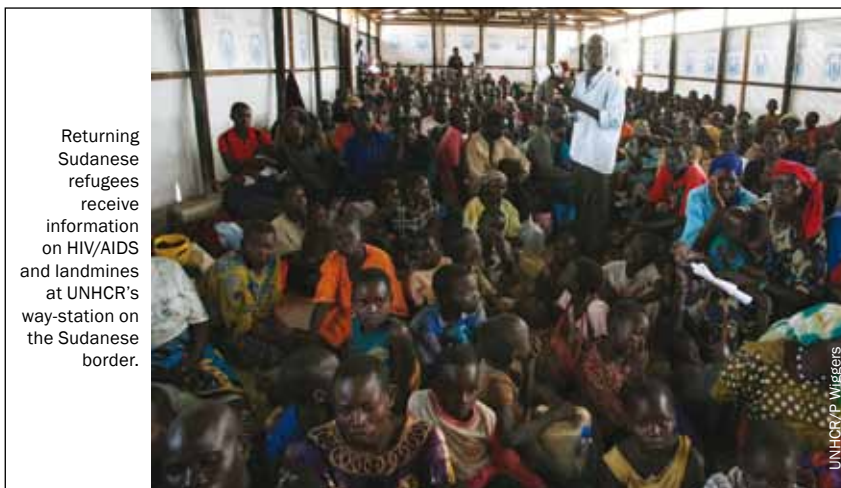
Returning Sudanese refugees receive information on HIV/AIDS and landmines at UNHCR's way-station on the Sudanese border.

The SPLA – the army of the Government of South Sudan (GoSS), previously the armed wing of the main southern Sudanese rebel movement (the SPLM) – is in the process of transforming from a guerrilla army to a professional military force. Challenges during the transition include ambiguity surrounding command structures, and increased cultural variation among soldiers (as all other armed groups, based on mainly tribal identity, had to be absorbed into the SPLA). The SPLA plans to downsize through the DDR process, which presents an opportunity for HIV interventions as soldiers make the transition to civilians.