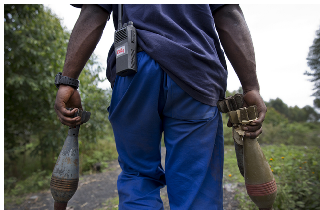
MONUSCO clears unexploded ordnance in Eastern DRC

The security of a state's citizens is intricately bound up with regional dynamics of conflict and insecurity, either as direct targets of transnational violence, as warring parties themselves, or as bystanders who are affected by conflict between neighbours. This is perhaps demonstrated nowhere more than in the Central African Republic, where domestic factors have been exacerbated by its location between six other countries, including Sudan, South Sudan and DRC. As Carayannis et al. (2014: 10) argue, 'While the battlefield may be local, violence transcends territorial boundaries.' Unsecured borderlands may be one of the most likely sources of insecurity, given the often asymmetric provision of security between the centre and periphery of states.