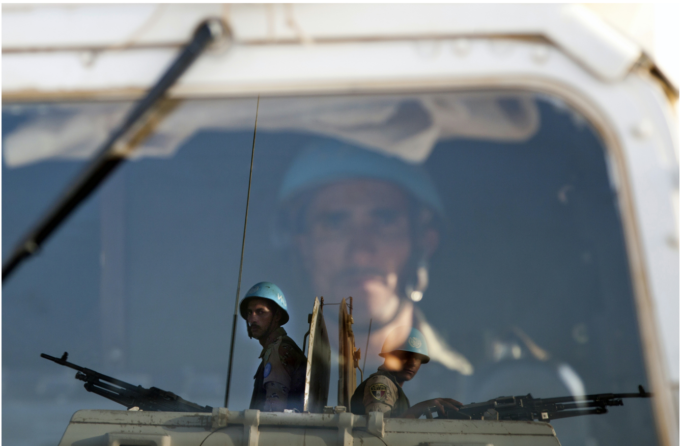
Egyptian Peacekeepers at work in North Darfur, Sudan

In a post-conflict environment, different overlapping factors will have a major influence on the nature, equity and sustainability of security. It is important to recognise that post-conflict transitions are multifaceted and rarely linear (Carayannis et al., 2014: 10; Dudouet, 2006: 12). Our analysis aims to review seven different factors that enable (or prevent) positive changes in citizens’ security, without the presumption that there will necessarily be continuity in these changes or that they will necessarily all