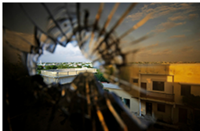
AMISOM Battalion in Mogadishu

The recognition that security is provided by a plural set of actors aligns with an increasing focus on different forms of public authority. New terms have emerged to capture this, such as ‘twilight institutions’ and ‘hybrid political orders’ (Lund, 2006; Boege, 2006). These aim to highlight the fact that in most contexts there are likely to be multiple and possibly intertwined ‘providers of security, welfare and representation, as the state shares authority, legitimacy and capacity with many other actors, networks and institutions’ (Luckham and Kirk, 2013b: 7). While non-state actors may provide more accessible and affordable security than the state, we make no claim