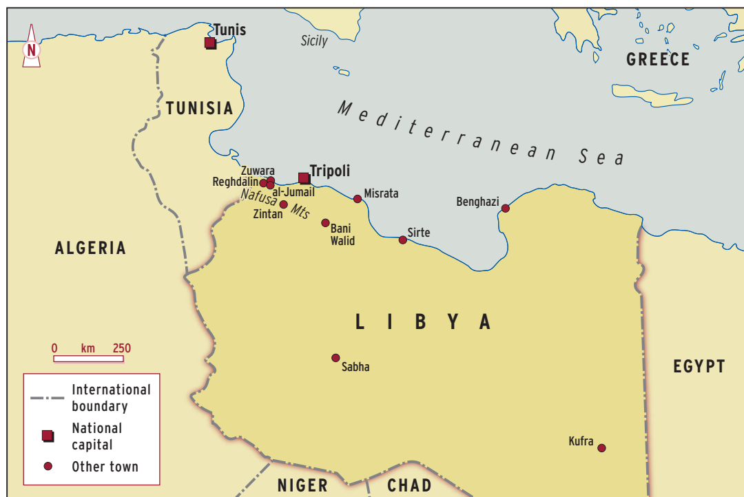
Map 1 Libya

Usually portrayed as chaotic and disorganized, the Libyan revolution was fragmented and decentralized, as exemplified by the emergence of revolutionary brigades ( kata’ib ) 2 in Misrata. The brigades began as uncoordinated street-fighting cells but evolved into organizations