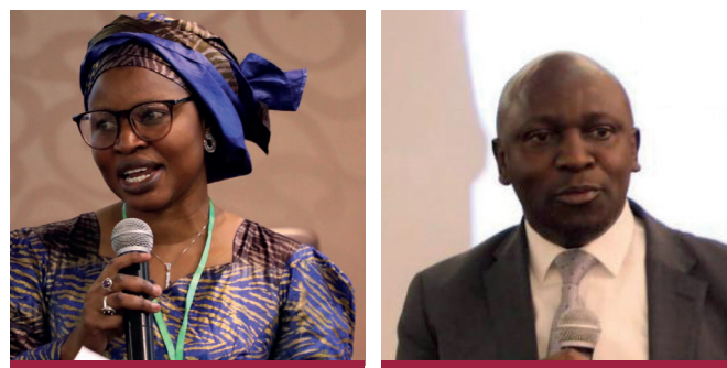
Participants of the Launch of Labour, Employment and Mobility Actions of The JLMP Lead Project.

The African Union Commission (AUC), International Labour Organization (ILO), the International Organization for Migration (IOM), Regional Economic Communities (RECs), and Member States launched a new three-year project; “The Joint AU-ILO-IOM-ECA Programme on the Governance of Labour Migration for Development and Integration in Africa (JLMP Lead)” project is to enhance the governance of labour, employment, and mobility on the African continent.