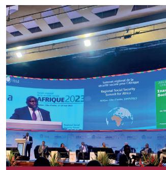
Representatives of AUC – Health, Humanitarian Affairs and Social Development Department.

The African Union Commission led by H.E. Amb. Minata Samate Cessouma inaugurated the Africa Social Security Institutions Coordination and Cooperation Forum (ASSCCF) at the ISSA Regional Social Security Forum (RSSF) held on the 19th of May 2023 in Abidjan, Cote D'Ivoire.