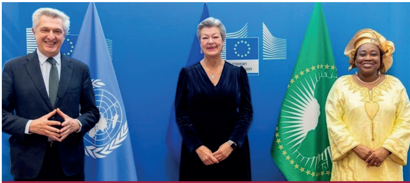
UN High Commissioner for Refugees Filippo Grandi, the EU Commissioner for Home Affairs, Ylva Johansson and Commissioner for Health, Humanitarian Affairs and Social Development of the African Union Commission, Minata Samate Cessouma

The AU–EU–UN Tripartite Taskforce on the Situation of Migrants and Refugees in Libya met in Brussels. The international community and Libyan authorities must work together to improve the plight of migrants and refugees in Libya.