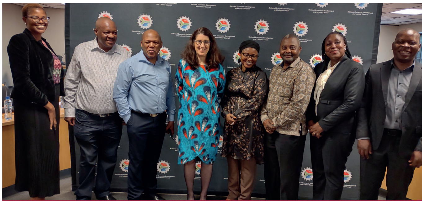
Representatives of the AUC – Labour Employment and Migration Division. and NEDLAC

The African Union Commission (AUC), guided by its vision of “An Integrated, Prosperous and Peaceful Africa, held a one-day meeting on 16th March 2023 with the National Economic Development and Labour Council (NEDLAC) Secretariat in Johannesburg, South Africa. The meeting aimed to exchange information on labor, employment, and migration governance, fostering multi-stakeholder policy consultation and practical coordination.