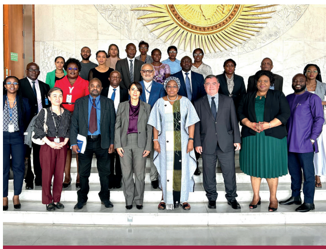
Participants of the Launch of African Union Commission – United Nations Economic Commission for Africa Migration Project.