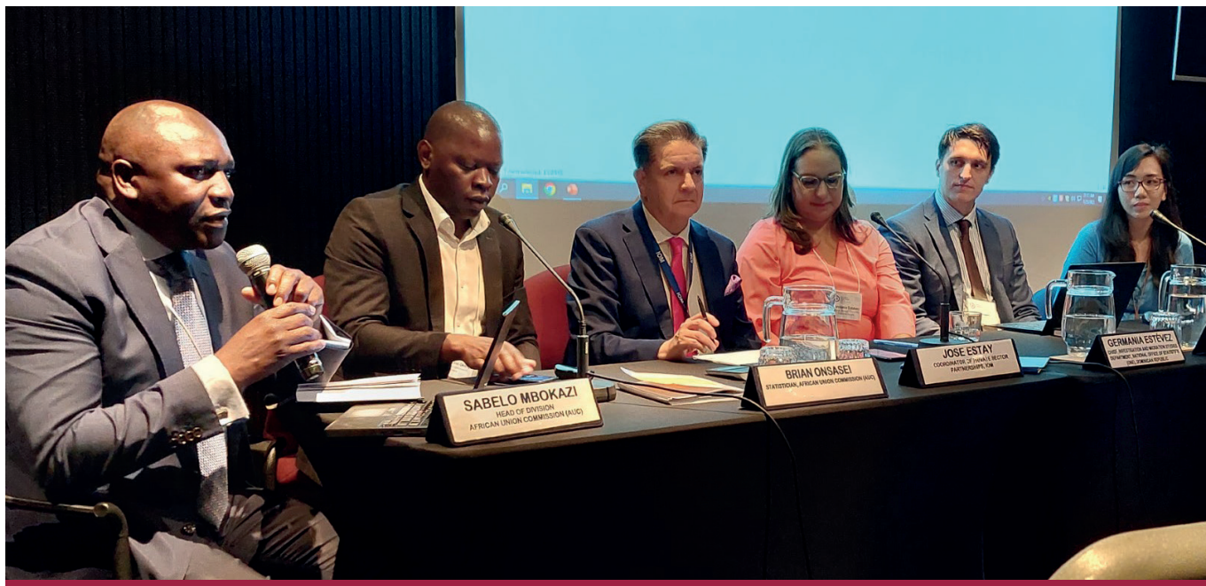
Participants of Strengthening Labour Market and Migration Information Systems with Real-Time Data and New Methodologies meeting .

The African Union Commission organized a parallel session on Strengthening Labour Market and Migration Information Systems with Real - Time Data and New Methodologies during the 3rd International Forum for Migration Statistics held at the United Nations Economic Commission for Latin America and the Caribbean (UNECLAC) in Santiago, Chile, from 24 to 26 January 2023. The IFMS 2023) was organized by the United Nations Department for Economic and Social Affairs (DESA) Statistics and Population Divisions, the Organization for Economic Cooperation and Development (OECD) and the International Organization for Migration (IOM) .