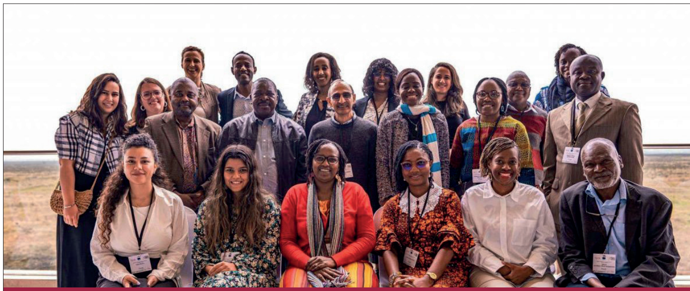
Participants of C2CMMD Training of Trainers.

The African Union Commission (AUC) and the International Centre for Migration Policy Development (ICMPD) organised a “Training of Trainers” (ToT) in Nairobi, Kenya, from 3-7 July 2023 with participants from across the African continent to be certified as trainers for the AU Migration Governance Training Programme.