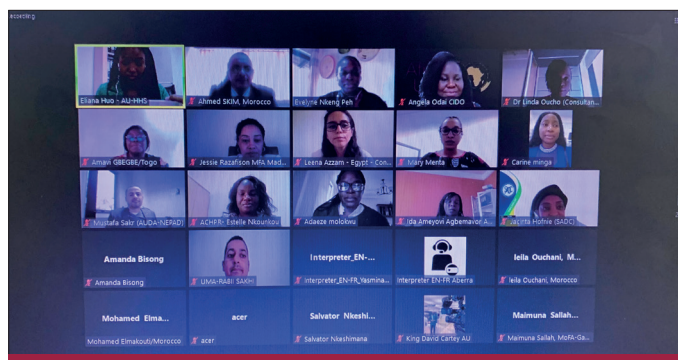
Participants at the Launch of the Mid-Term Assessment of the MPFA.