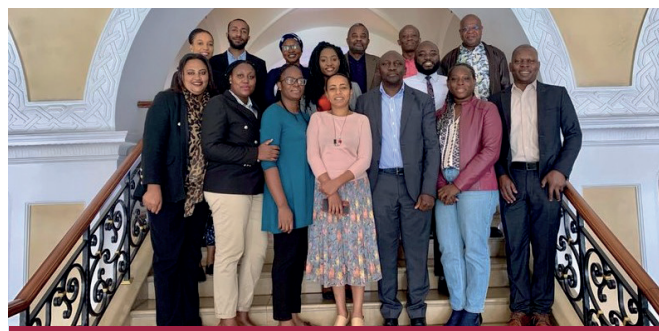
Members of the AUC – Labour Employment and Migration Division.