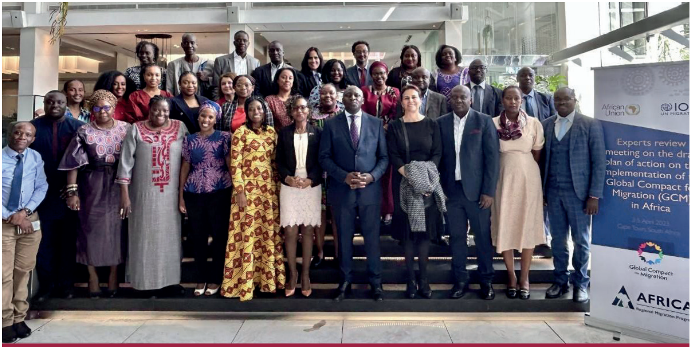
Participants of the Experts Review Meeting on The Draft Plan of Action on The Implementation of The GCM In Africa.

The African Union Commission (AUC) in collaboration with the International Organization for Migration (IOM) Special Liaison Office (SLO) to the African Union & UNECA held a 3-day Experts Review Meeting on the Draft Plan of Action (PoA) on the Implementation of the Global Compact for Migration (GCM) in Africa in Cape Town, South Africa, from 3 – 5 April 2023. The Draft Plan of Action considers African migration priorities, policies, Agenda 2063, and Agenda 2030 SDGs, and provides member states and Regional Economic Communities (RECs) with a continental framework that will assist them in the formulation of respective national and regional GCM implementation plans in accordance with their priorities and resources.