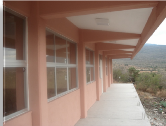
College at Chucándiro, Mich. / Club de Migrantes Chucándiro, Nevada