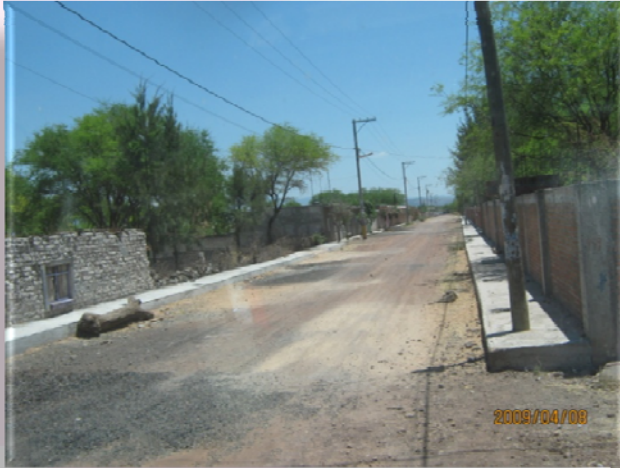
Electricity at León Cárdenas, Álvaro Obregón County, Michoacán / Club León Cárdenas (HTA), Chicago