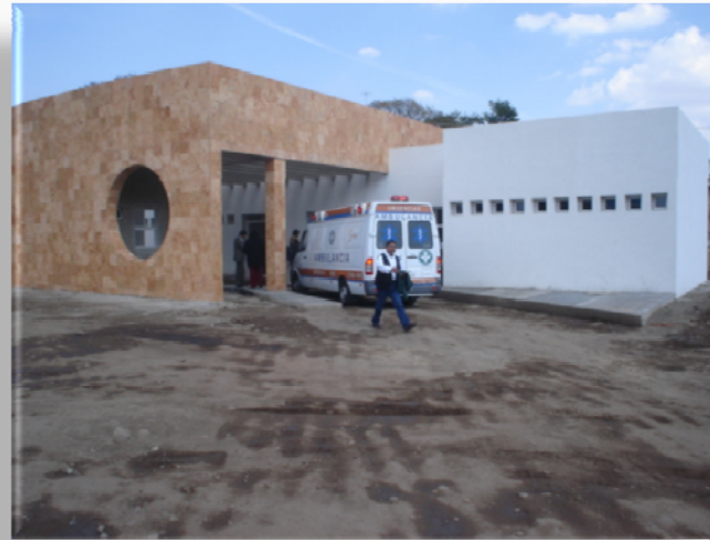
Health Center at Tlajomulco, Jal. / Clubes Unidos Tlajomulquenses, California