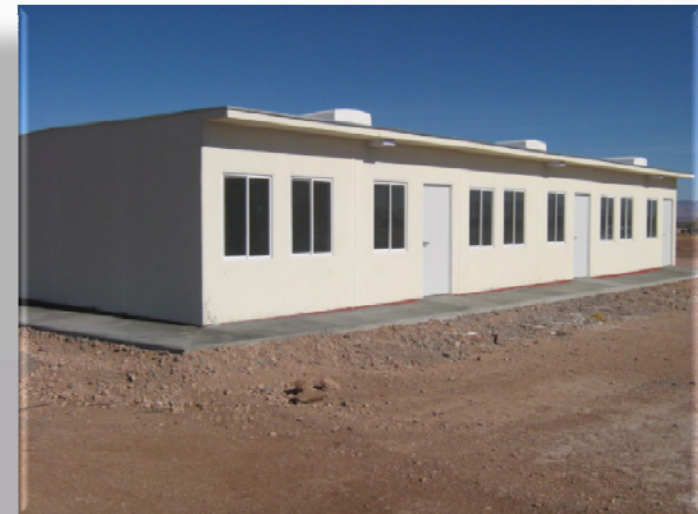
High school at Casas Grandes, Chih. / Club Fundación de Amor y Esperanza, Arizona