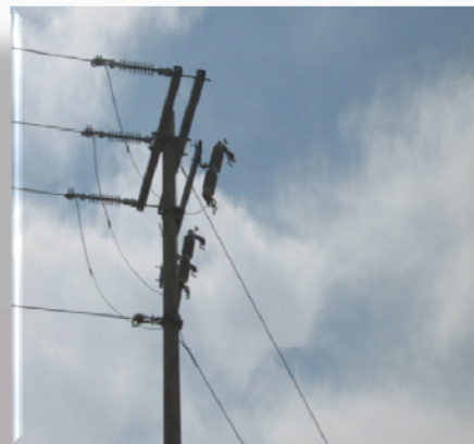
Electricity at Villa de Ramos, SLP / Club Unidos por San Luis (HTA) , Texas