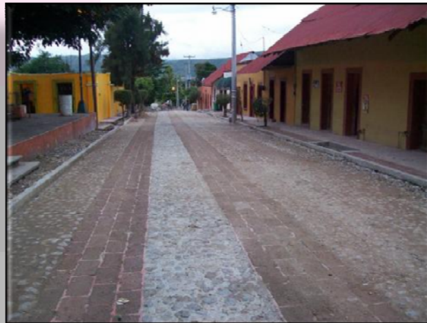
Paved Streets at Jalpan, Qro. / Club Tancoyol, Illinois