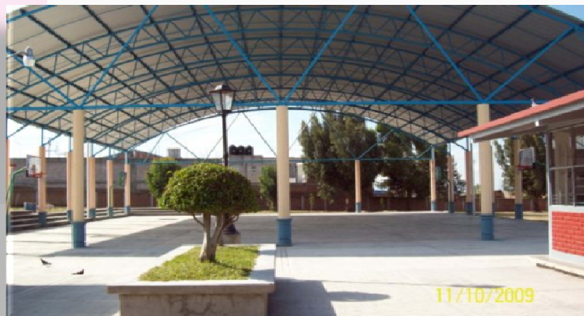
Elementary School civic patio, Tarandacua, Gto. / Club Pineda Lira , Illinois