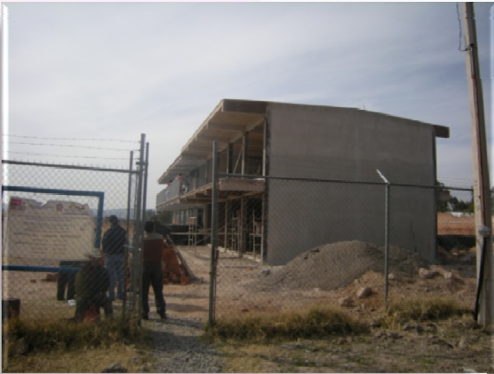
High School at Tepatitlán, Jalisco / Club Amigos de San José de Gracia, California