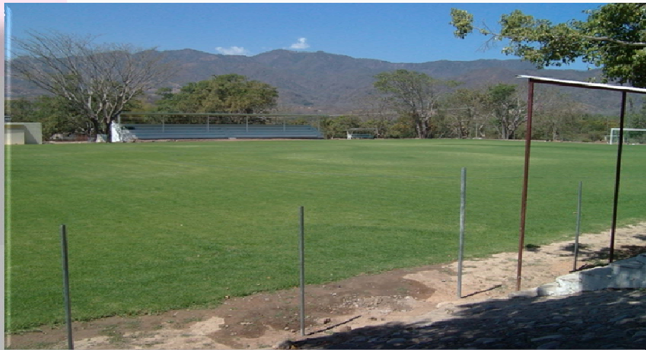
Soccer field at Minatitlán, Colima / Club Minatitlán, California