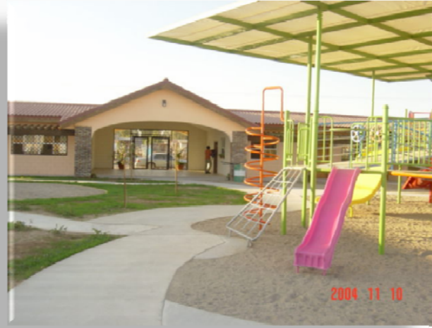
Rehab Center for disabled children Wakiñul / Club California