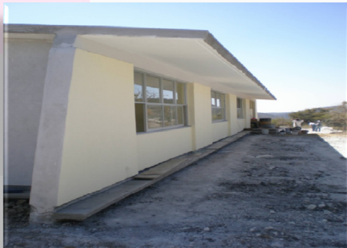
College at Tochimiltzingo, Oax. / Club Gala y Amigos, California