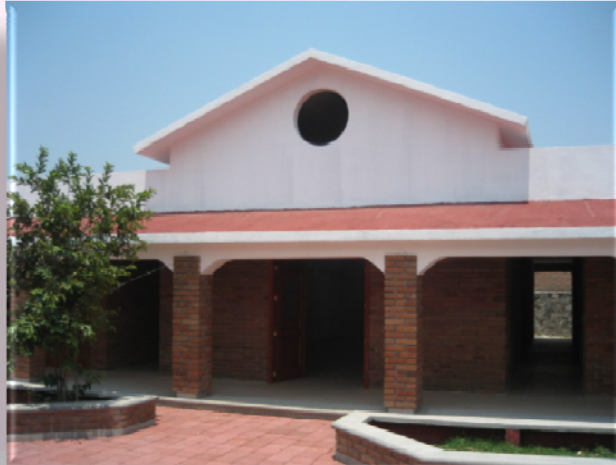
Asylum at Zinapécuaro, Mich. / Club Zinapécuaro, Illinois