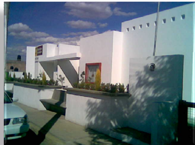
Health Center at Cieneguitas, Zac. / Club Tacoaleche, Dallas, Texas