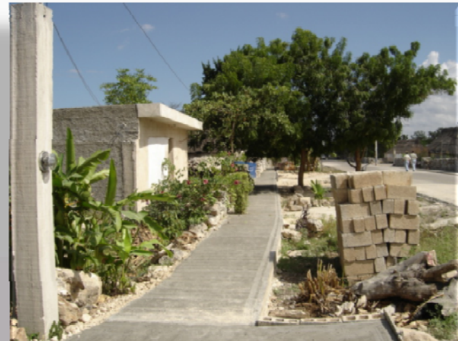
Sidewalk Construction at Dzizantun, Yuc. / Club Dzizantun, California