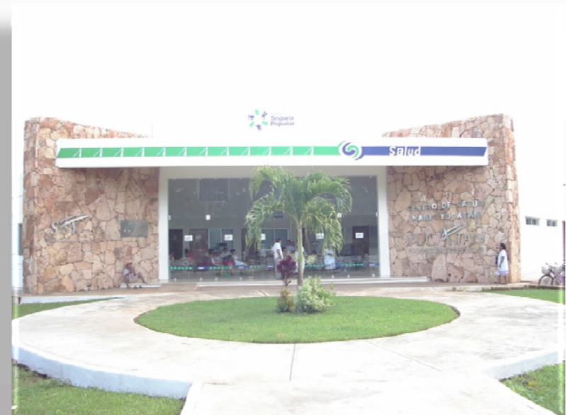
Health Center at Maní, Yucatán / Club Voces de Maní en Portland, Oregon