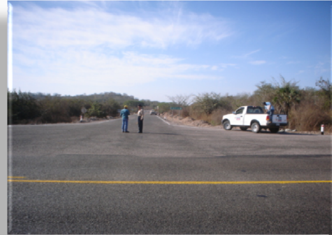
Paving camino El Aguaje, Acaponeta, Nayarit / Club Social Acaponetense / California