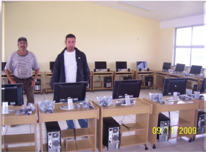
Furniture and computing equipment at Laguna Grande, Monte Escobedo / Comunidades Unidas de Monte Escobedo, Ca.