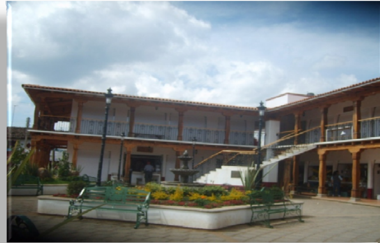
Local Market, Atemajac de Brizuela, Jal