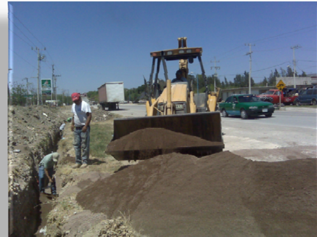
Water supply at Cárdenas, SLP/ Club El Chaparral (HTA), Texas