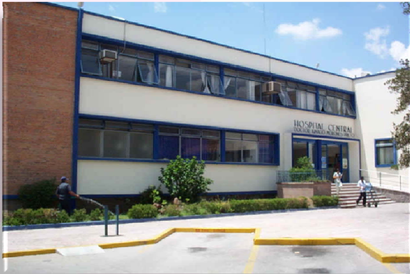
Electrification at Hospital Ignacio Morones P., SLP/ Club Rotary Memorial, Texas