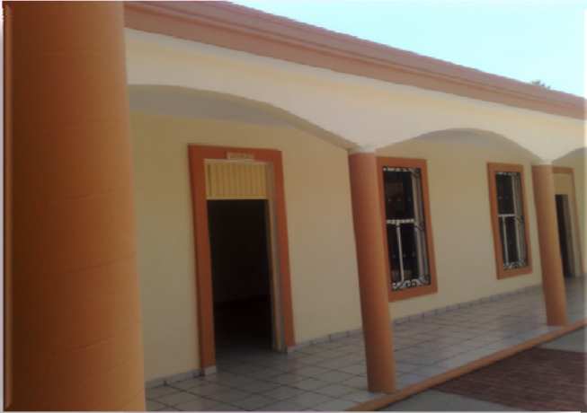
Culture House, Elota, Sinaloa / Fraternidad Elotense, California