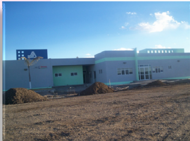
Regional Hospital at Nuevo Ideal, Dgo. / Club Unidos por un Sueño, Illinois