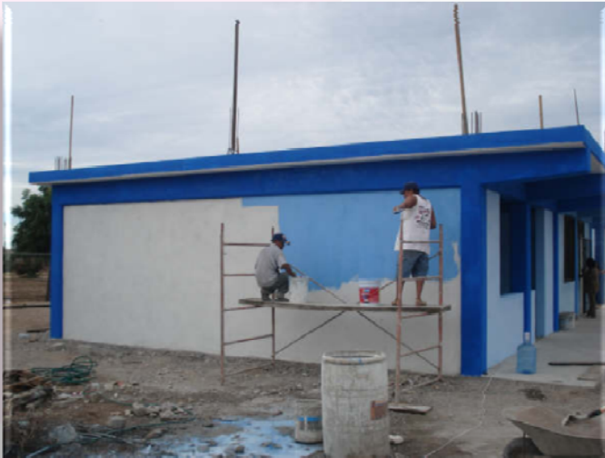
Junior High school classroom at G. Samble, Elota, Sinaloa / Fraternidad Elotense, California