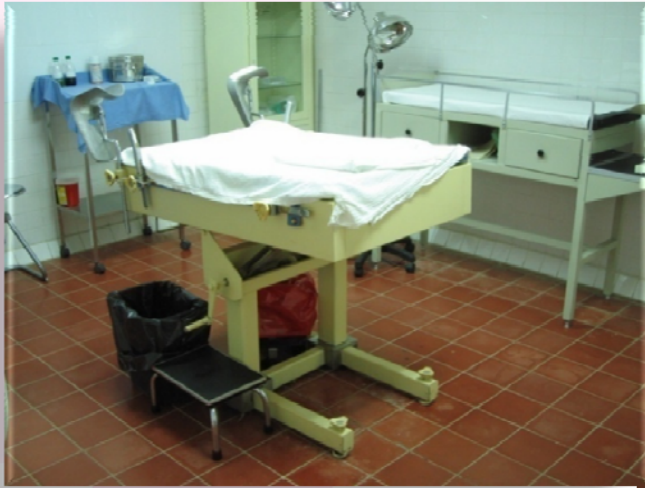
Health Center El Tuito, Jal. / Club Amigos de Cabo Corrientes, California