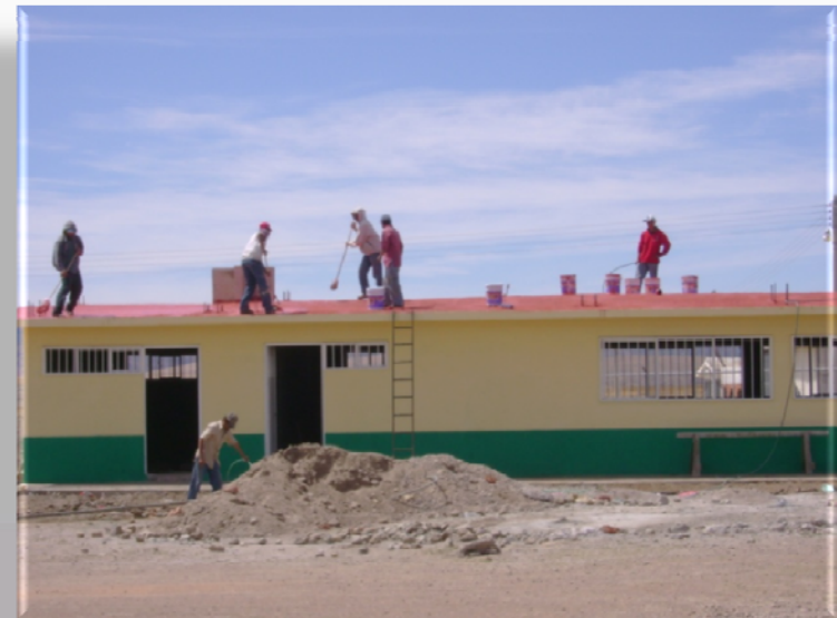
College at Genaro Codina, Zacatecas / Club Social Tepechitlán