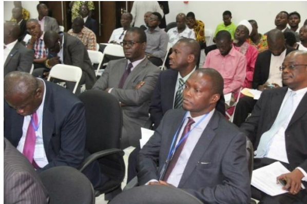
A cross-section of participants