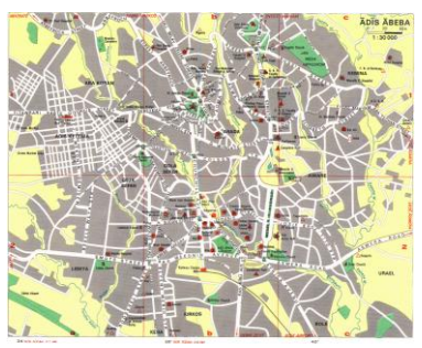
Click map above to go to the original online

Please note that relying on your mobile device for maps and travel guidance may incur additional charges on your bill and may not be available straightforwardly.