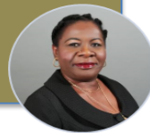
Luisa Diogo Deputy Chairperson of the AU Foundation