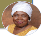
Dr Nkosazana Dlamini Zuma