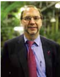
Peter Piot, Handa Professor of Global Health, London School of Hygiene & Tropical Medicine