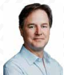
Sir Nicholas Clegg , President, Meta (formerly Facebook) & fmr Dep. Prime Minister of the UK