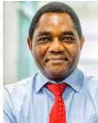
H.E. Hakainde Hichilema , President of Zambia