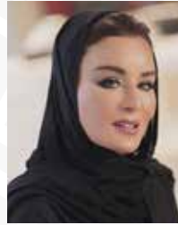
Sheikha Moza bint Nasser , Chairperson, Qatar Foundation