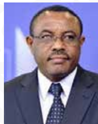
H.E. Haile Mariam Desalegn , Board Chair of AGRA & fmr Prime Minister of Ethiopia