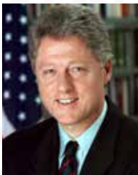
William Clinton , 42nd President of the United States