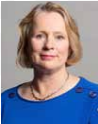
Hon. Vicky Ford, UK Minister for Africa