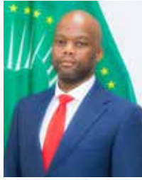
H.E. Wamkele Mene , Secretary-General, AfCFTA