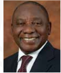
H.E. Cyril Ramaphosa , President of South Africa