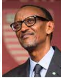
H.E. Paul Kagame , President of Rwanda