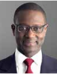
Tidjane Thiam, Chairman, Freedom Acquisition Corp & fmr CEO, Credit Suisse