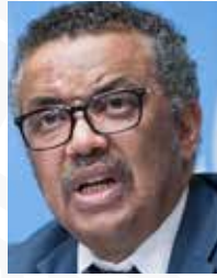
H.E. Tedros Ghebreyesus , Director-General, WHO