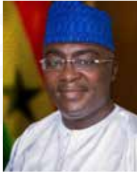
H.E. Dr. Mahamadou Bawumia , Vice President of Ghana