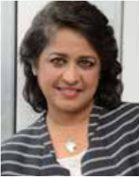
H.E. Ameenah Gurib-Fakim , Scientist & fmr President of Mauritius