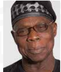
H.E. Olusegun Obasanjo , AU Envoy & fmr President of Nigeria