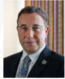
H.E. Achim Steiner , UNDP Administrator