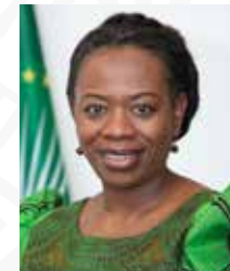
H.E. Monique Nsanzabaganwa, Deputy Chairperson, AU