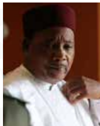
H.E. Mahamadou Issifou , AfCFTA Champion & fmr President of Niger