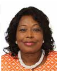
H.E. Minata Samate , AU Commissioner for Social Affairs