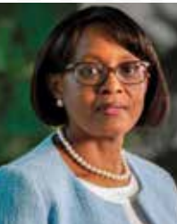
Matshidiso Moeti , WHO Regional Director for Africa