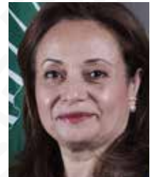
Amani Abou-Zeid , AU Commissioner for Infrastructure