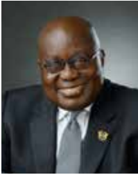
H.E. Nana Akufo Addo , President of Ghana