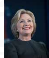
Hillary Clinton, Chancellor of Queens University Belfast