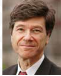
Jeffrey Sachs, University Professor, Columbia University (TBC)