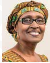
Winnie Byanyima, Executive Director, UNAIDS