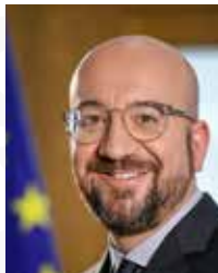
Charles Michel, President of the European Council