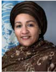
Amina Mohammed, Deputy Secretary- General, United Nations