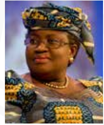
Ngozi Okonjo-Iweala, Director-General, WTO