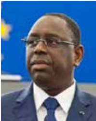
H.E. Macky Sall , AU Chairperson & President of Senegal