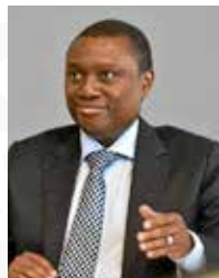
Sim Tshabalala, CEO, Standard Bank