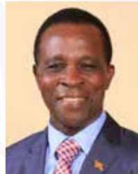
R.H. Keith Mitchell , OECS Chairman & Prime Minister of Grenada