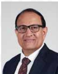
Hon. S. Iswaran, Minister of Transport, Singapore