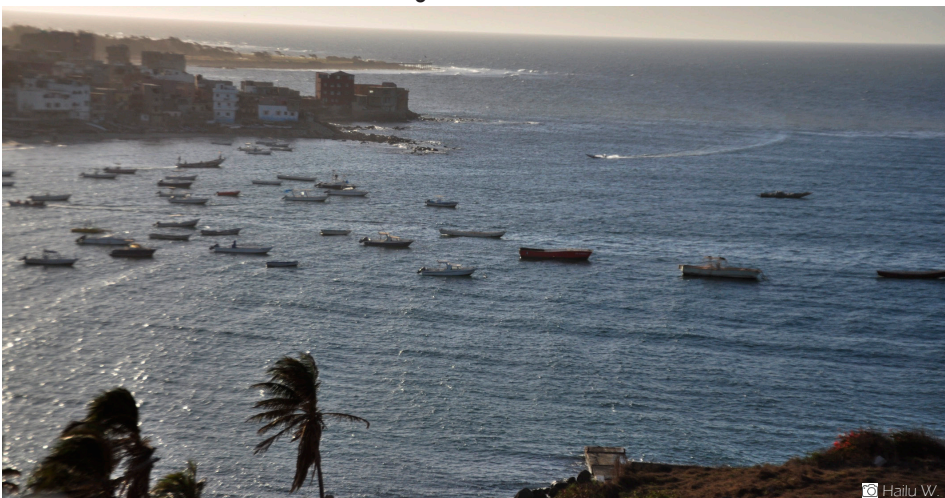
Fishing in Dakar

The GMES & Africa Support Programme uses Earth Observation and space technologies to generate information and services for sustainable development in Africa, through environmental and natural resources management. The programme aims to improve African policy-makers' and planners' capacities to design, implement, and monitor national, regional and continental policies and to promote the sustainable management of natural resources through the use of Earth Observation data and derived information.