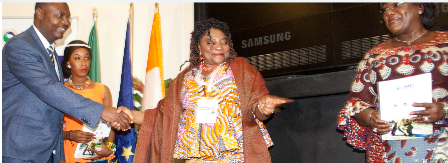
Grant award ceremony for thirteen successful consortia of African institutions

On the sidelines of the AU-EU Summit held in December 2017 in Abidjan, Cote d'Ivoire, the African Union Commission (AUC) officially awarded thirteen successful consortia of African institutions that will serve as Regional Implementing Centres for the Global Monitoring for Environment and Security and Africa (GMES and Africa) Support Programme grants.