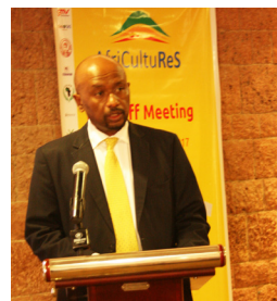
Minister of Energy, Water & Electricity-Ethiopia