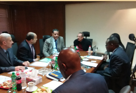
Due Diligence Mission at NARSS, Egypt