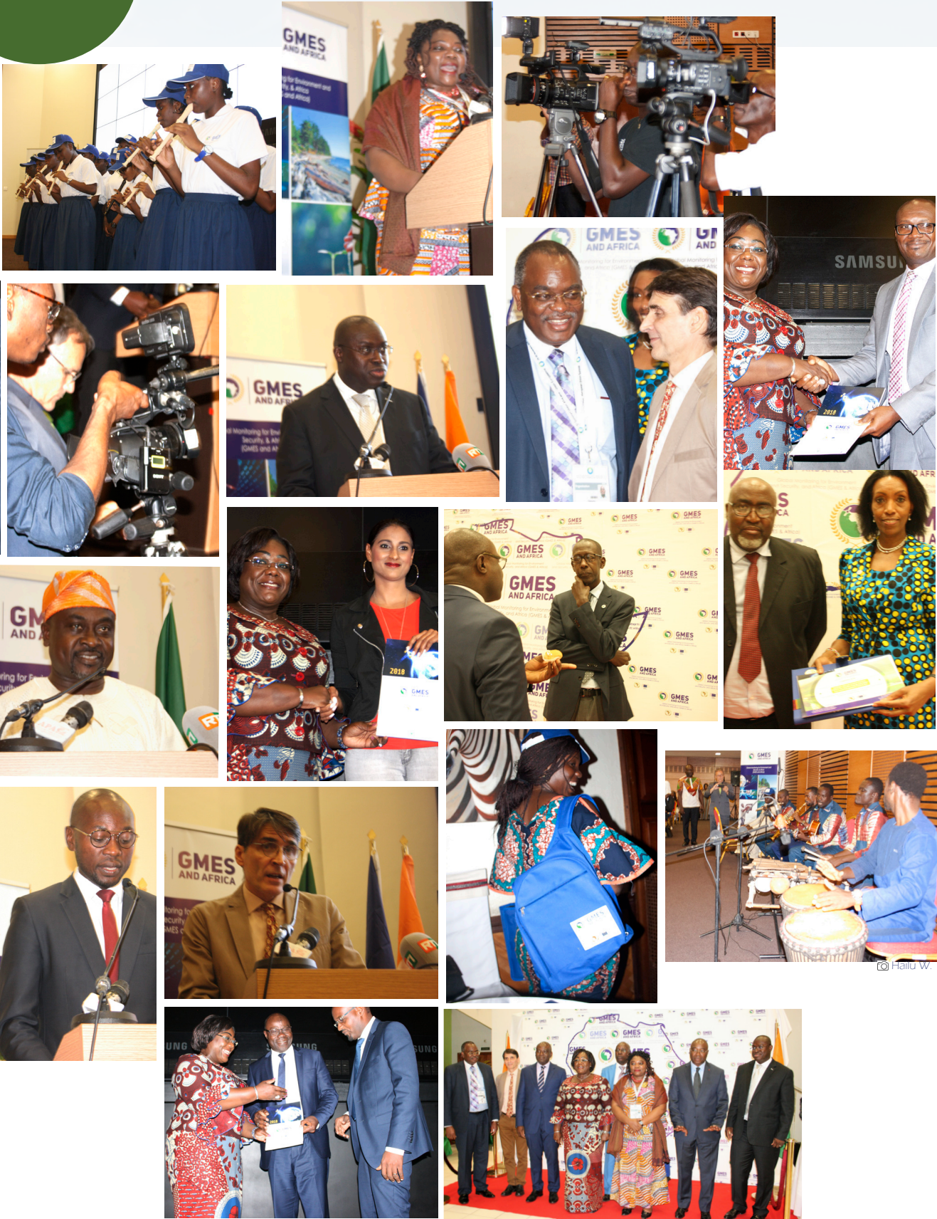
Grant award ceremony for thirteen successful consortia of African institutions-Abidjan