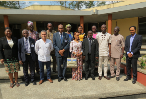
Due Diligence Mission at Ile Ife University, Nigeria