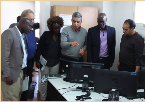
Due Diligence Mission at OSS, Tunisia