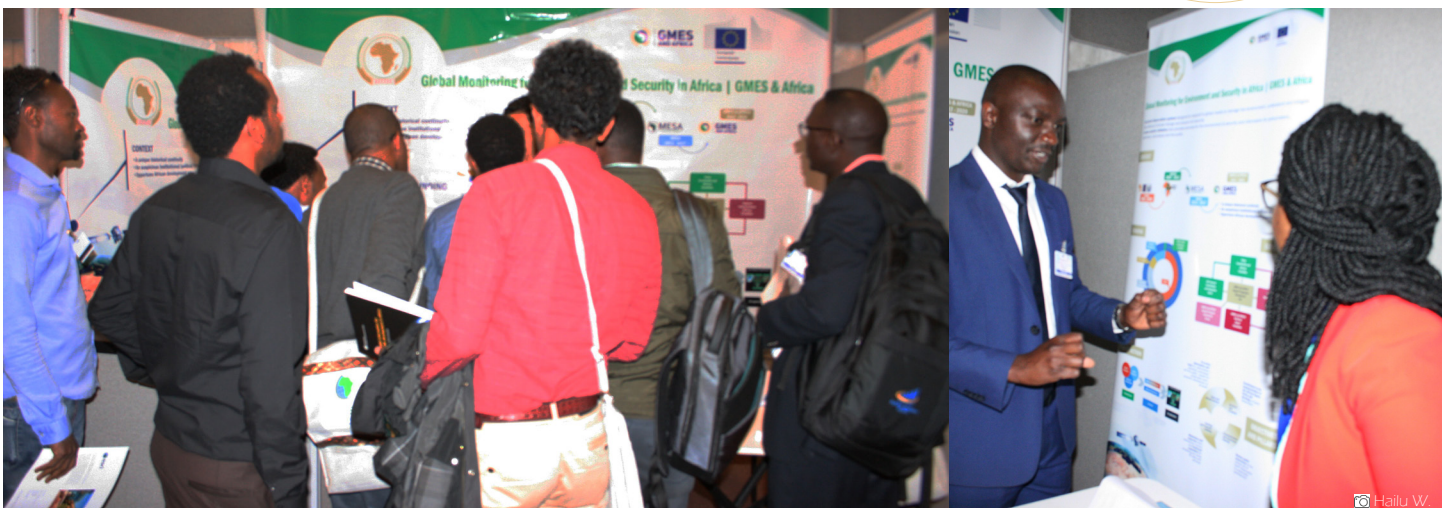
GMES and Africa's Support Programme Exhibition at Africa GIS 2017