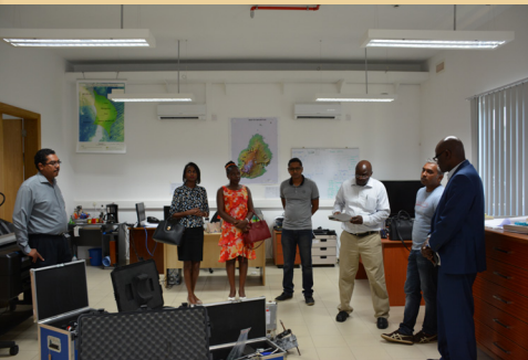
Due Diligence Mission at MOI, Mauritius

Involving stakeholders and end users from the onset of continental and joint projects is a cardinal principle of the African Union. This position of the AU was amplified during the kick off meeting of AfriCultuReS (African Agricultural Systems with the Support of Remote Sensing) Project, which was held from 23 to 24 November 2017, In Addis Ababa, Ethiopia.