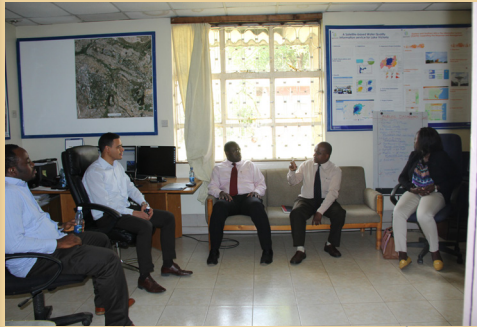
Due Diligence Mission at RCMRD, Nairobi