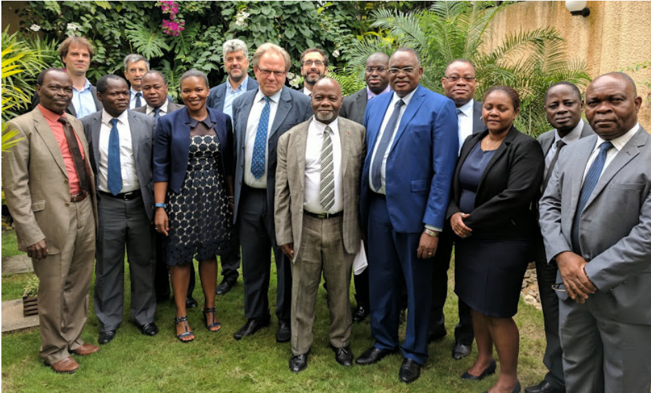
Group photo of GMES and Africa Policy Coordination and Advisory Committee

The GMES & Africa Support Programme Policy Coordination and Advisory Committee (PCAC) held its inaugural ordinary session in Abidjan, Côte d'Ivoire, from 4 to 6 September, 2017. PCAC is a key governance pillar of the GMES & Africa Support Programme.