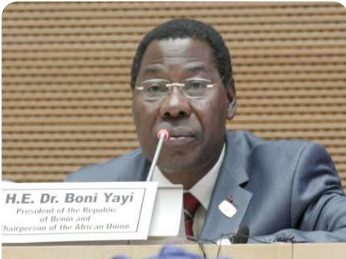
H.E. Dr. Boni Yayi President of the Republic of Benin and Chairperson of the African Union