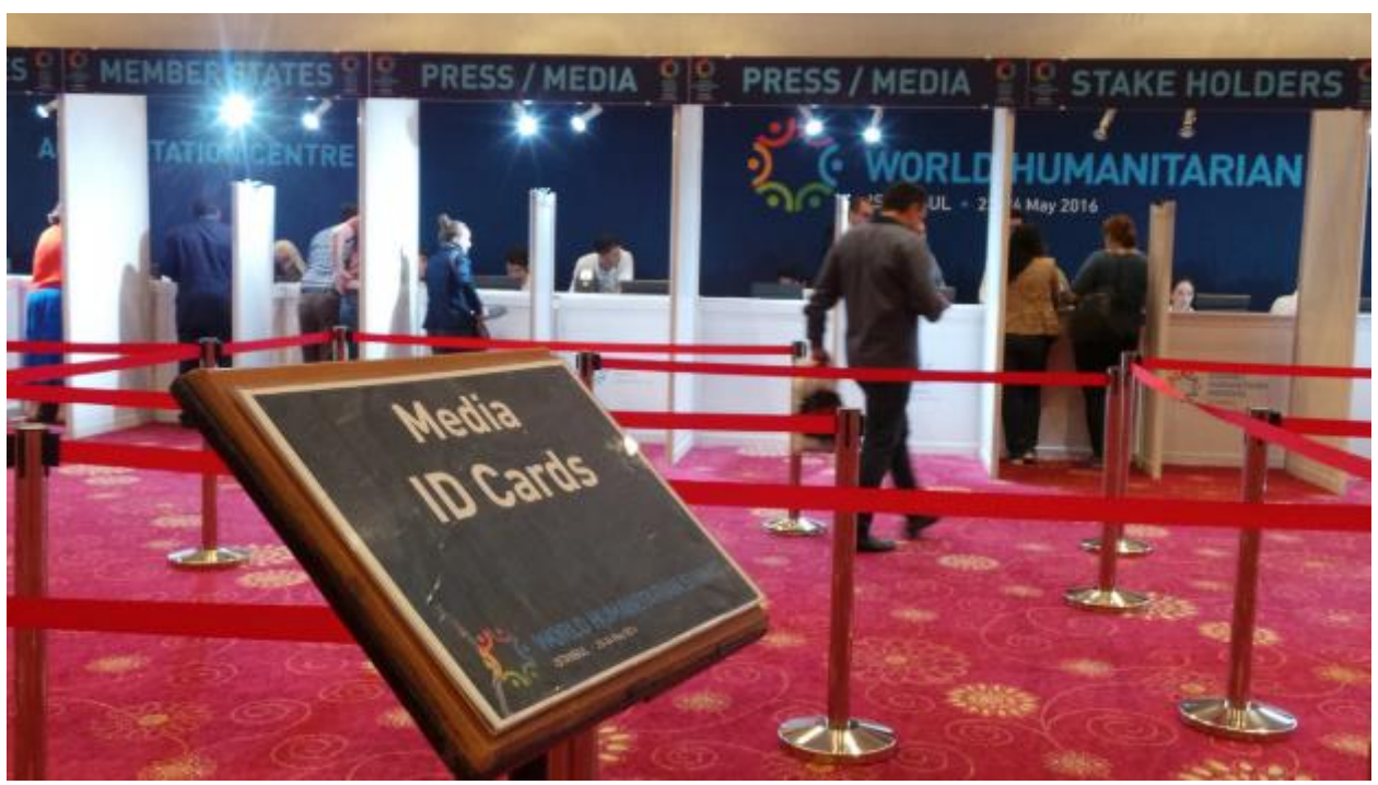
The World Humanitarian Summit will therefore address the extraordinary challenges to the current international humanitarian system.

Today, 80% of humanitarian needs are caused by conflict, with most being recurrent or protracted crises lasting years long. Moreover, such crises are transcending borders as the recent tragic exodus of refugees and effects of pandemics are constantly reoccurring.