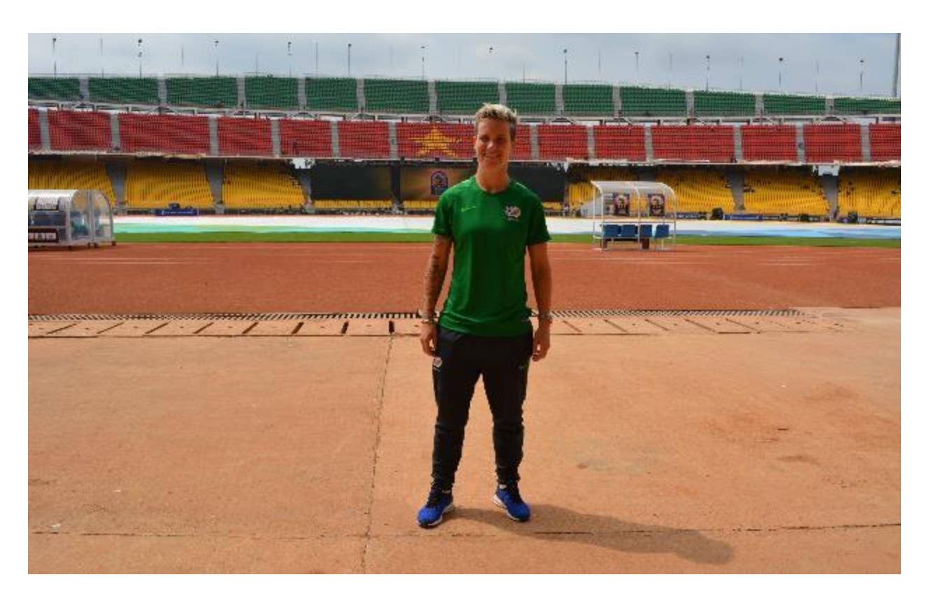
"Women have a lot to offer in building the continent. Our leaders should promote sports to help with the development of children and of the young girls".