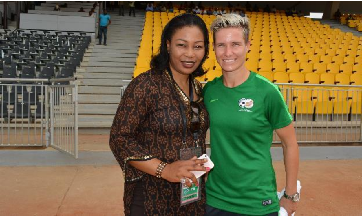
"Together let us combat against the marriage of the girl child..."