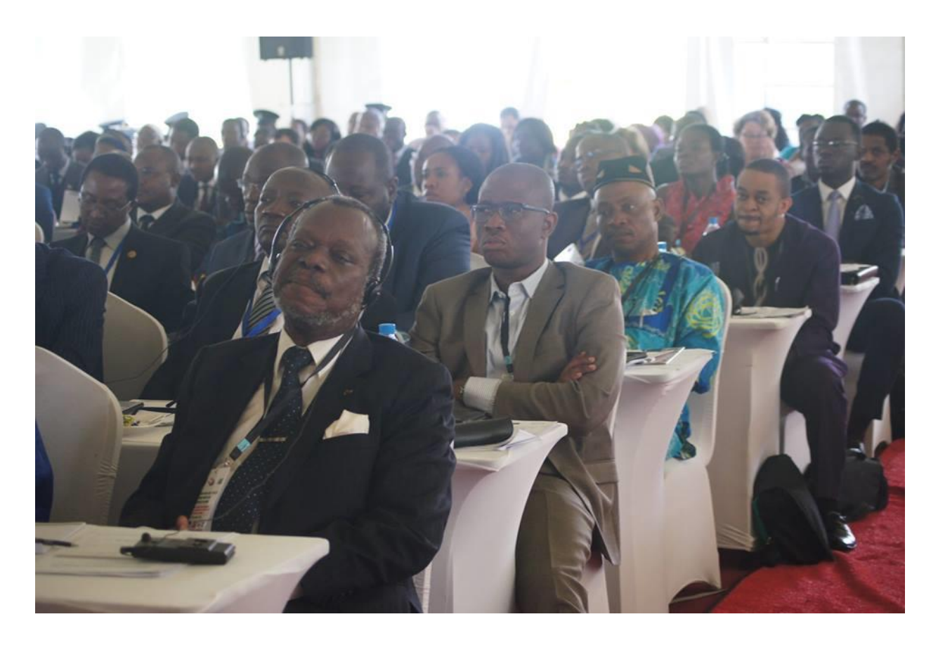
Hon. Samia further highlighted that despite the existing intricate correlation between human rights and women rights, Africa still continues to experience, among other things the practice of female genital mutilation and early marriages, few education opportunities,

The Vice President of the United Republic of Tanzania, Hon. Samia Suhulu Hassan, in her opening remarks, extended words of welcome to the distinguished participants and underlined that, the dialogue comes at an opportune moment when many countries in Africa are at the stage of transforming their economies to middle income economies emphasizing on the importance of incorporating human rights in business. Hon. Samia Suhulu commended the African Union for the achievements that have been attained over the years, particularly in the area of human rights but underscored that "we should not be blinded by these successes and headways, rather we should be able to assess whether they have made significant impact to the majority of our people in the continent."