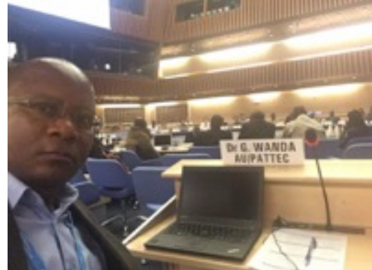
Participants during the meeting

In his remarks, Dr. Wanda commended WHO for ensuring consistency and tangible outputs of the series of meetings since their inception four years ago and in particular welcomed the ever increasing recognition of vector control as a significant contributor towards the goal of eliminating gambiense sleeping sickness as a public health problem by 2020. He called for greater information sharing through the established national, regional and continental structures on success stories being registered by the various players in the sleeping sickness domain to enable PATTEC accurately brief the African