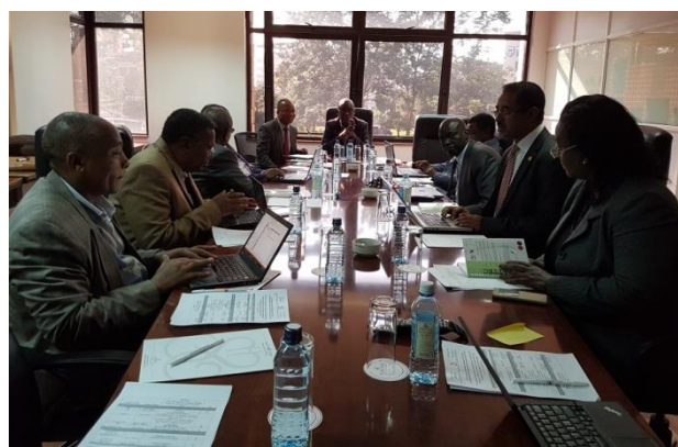
Group photo (left), discussion session (right)

The overall objective of the consultative meeting was to brainstorm on mechanisms for integrating T&T intervention programmes into regional development policy objectives with the view to enhance regional ownership, effective coordination and sustainability. The specific objectives include but are not limited to the following: a) To strengthen coordination for the management of T&T at regional levels; b) To enhance formulation of sound policies and strategies for the management of T&T at regional level; c) To explore sustainable regional funding mechanisms for T&T programmes; d) To undertake a stakeholder mapping to inform establishment of regional T&T networks; e) To identify mechanisms of institutionalizing and mainstreaming T&T programmes in regional development strategies and policy objectives; f) To explore ways of improving inter-country, intersectoral and multi-agency collaboration in the management of T&T.